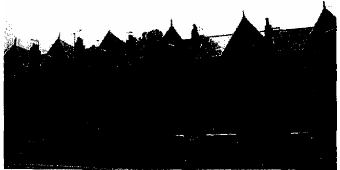
Unusual bay window roofs on Union Road create a pleasing sense of rhythm.

Despite the reliance upon pattern books, a number of the houses display unusual features which make them locally distinctive. Many interesting forms are repeated throughout the area offering a sense of visual continuity, for example, the steeply pitched bay window roofs with an inset dormer at 81-91 Union Road which also appear along Larkhall Rise. The roofscape of many houses within the proposed Conservation Area are of particular interest, for example, the centrally placed paired square turrets which appear along Sibella Road, the decorative features which atop the chimneys at 25-39 Larkhall Rise and the repetition of the large gables and attractive bargeboards which create a pleasing sense of rhythm along Chelsham Road.