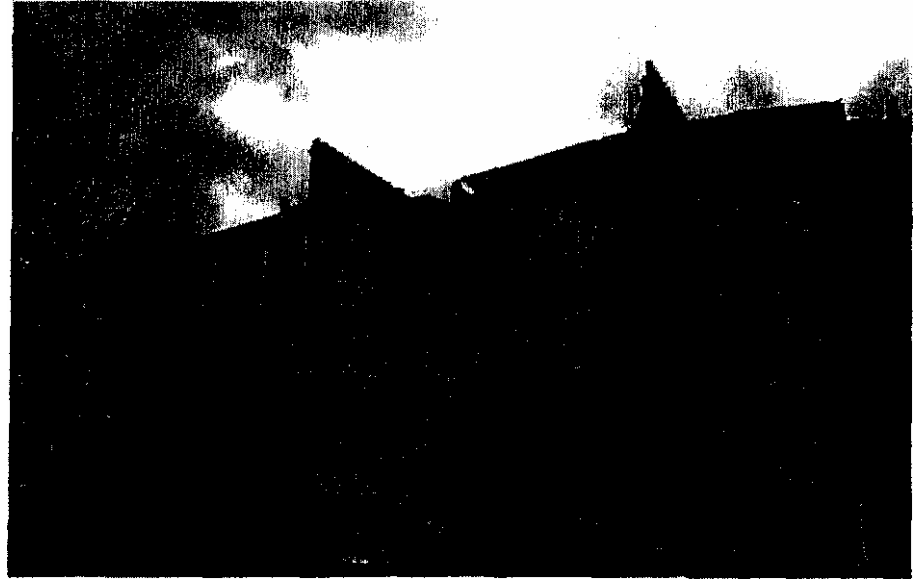
25-39 Gauden Road

Standard mid Victorian speculative building forms such as the semi-basement and canted bay are widespread features within the proposed Conservation Area. The popularity of the canted bay as a means of bringing additional light and space into front rooms was boosted after 1851 by the availability of cheaper glass in large panes. The demise of the basement, an essentially Georgian feature, coincided with the rise of the bay window and many houses within the area, such as on Union Road and Sibella Road are without basements. These features are combined however on many houses, for example at 25-39 Gauden Road where bay windows are used as an exuberant decorative feature and at 20-34 Gauden Road where they are used in a more restrained and simple manner.