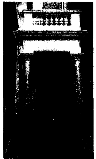
Classical style entrance porch.

Classical and Italianate forms can be seen in the acanthus topped columns and pilasters surrounding doors, the balustrades over entrance porches, found with an unusual pierced clover motif at 59-97 Bromfelde Road and a guilloche pattern at 1-7 Gauden Road, stucco architraves and console brackets to windows and the scrolled brackets supporting the ground floor bays at 2-8 Gauden Road and 41-63 Larkhall Rise.