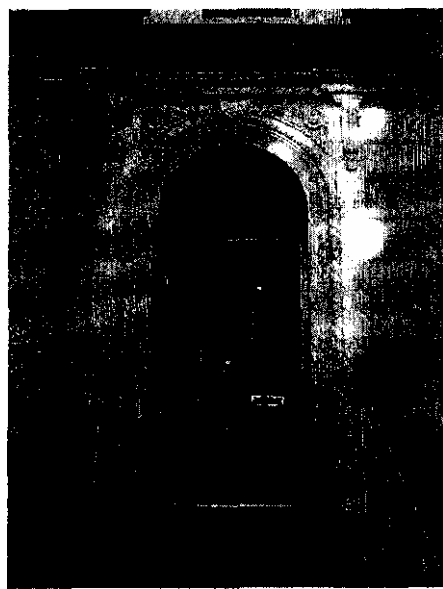
Decorative stucco doorway

although only on the front elevations, with cheaper yellow stocks to the side and rear. A limited amount of polychrome detailing appears to the gault brick facades at 44-62 Chelsham Road where gauged brick arches appear with alternating red and yellow brickwork. Stucco is a widespread and important decorative feature, used in varying degrees on lintels, around doors and windows, as corbels at the eaves of many houses and decoratively as balustrades, keystones and columns.