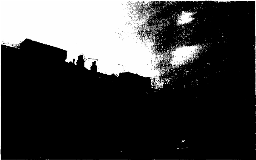
The street trees along Sibella Road contribute towards the suburban and leafy character of the proposed Conservation Area.

The proposed Conservation Area appears relatively densely developed when viewed from the public realm, characterised by its runs of terraced buildings and in many cases, such as at 1-21 Larkhall Rise and 62-82 Bromfelde Road, terraces which give the impression of semi-detached properties through the use of an inset bay between each pair. Nonetheless, the area has a distinctly leafy and suburban feel, despite its urban location. This is engendered by its wide streets, mature street trees and greenery, such as on the corner of Bromfelde Road, and plentiful soft landscaping which appears in the front gardens of many houses. This impression is heightened by the large plot sizes and from the glimpses of mature rear gardens through the gaps between detached buildings and semi-detached pairs, as well as oblique views at street corners. There are a number of points throughout the proposed Conservation Area where the rear elevations and rear roof slopes of properties can be viewed from the public highway, such as at the corner of Sibella Road and Bromfelde Road, offering glimpses into back gardens and blurring the obvious distinction between the public face of the buildings and the private realm to the rear of properties.