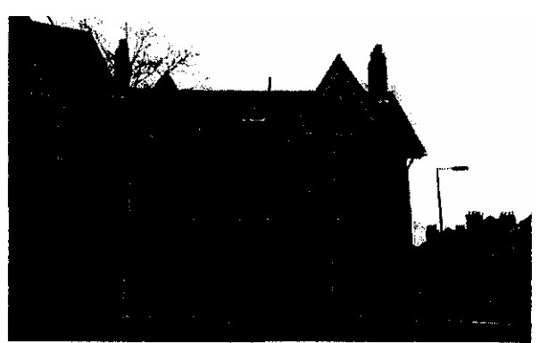
41 Gauden Road

The only building within the proposed Conservation Area constructed for non-residential use is Fern Lodge at 118 Gauden Road. dating from 1875-77. This imposing red brick building has a pair of steep gables, a gothic arched door and pointed arches to its third floor windows, infilled with a herringbone pattern of red and grey bricks. This building was originally built as a grammar school but has been in use as a working men's social club since the early 20<sup>th</sup> century.