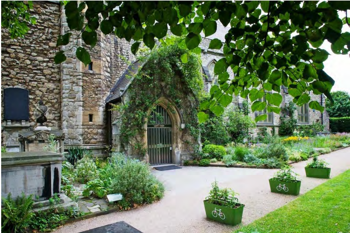
Plate 4. Frontage of the 'Garden Museum' in Waterloo, one of Lambeth's flagship sites for promoting wildlife-friendly gardening to its residents but Londoners as a whole

It shows how what we do for biodiversity links in to other important policies, obligations and initiatives, such as making and keeping Lambeth safe, clean and green, as well as preventing and curbing pollution, widening the use and enjoyment of natural resources by all of Lambeth's diverse communities, and improving the quality of our open spaces and heritage features.