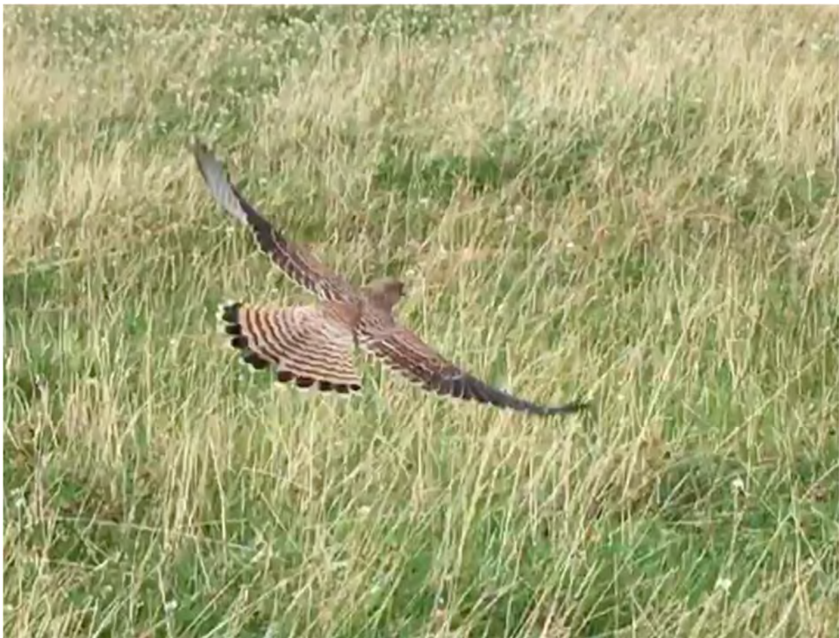
Plate 37. A male kestrel ( Falco tinnunculus ) 'quartering' in Brockwell Park, searching for small mammals across the extensive areas of meadow grassland