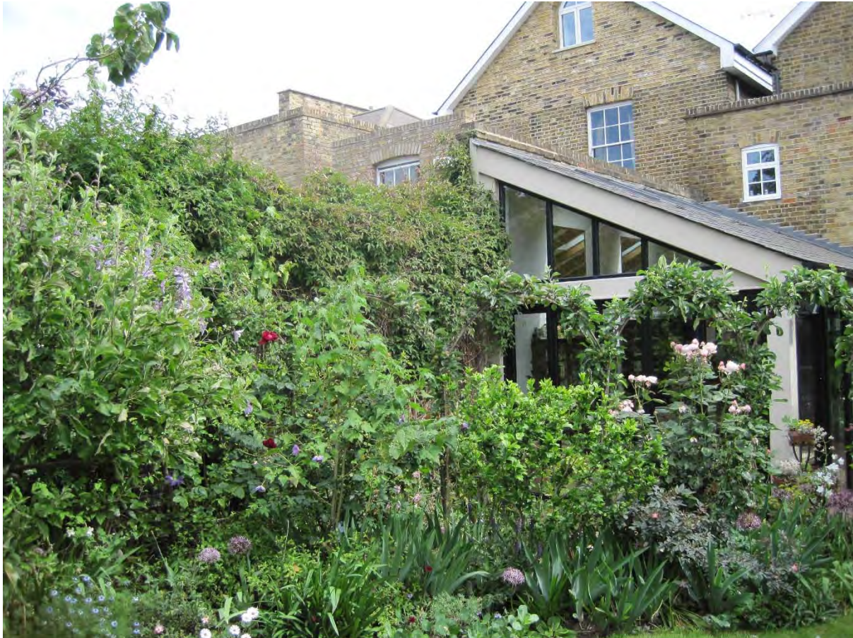
Plate 12. A wildlife-friendly private garden in Stockwell

Lambeth has a high incidence of recorded serious mental illness, in fact some of the highest rates per head of population in Greater London and England. Levels of depression, anxiety and other chronic mental health conditions are unacceptably high. Free and safe access to parks and green spaces has been shown to significantly reduce levels and severity of mental illness in local populations. This effect is markedly enhanced by increased access to nature and natural spaces, especially if well managed and promoted for their health benefits, which is what the Lambeth BAP will set out to achieve.