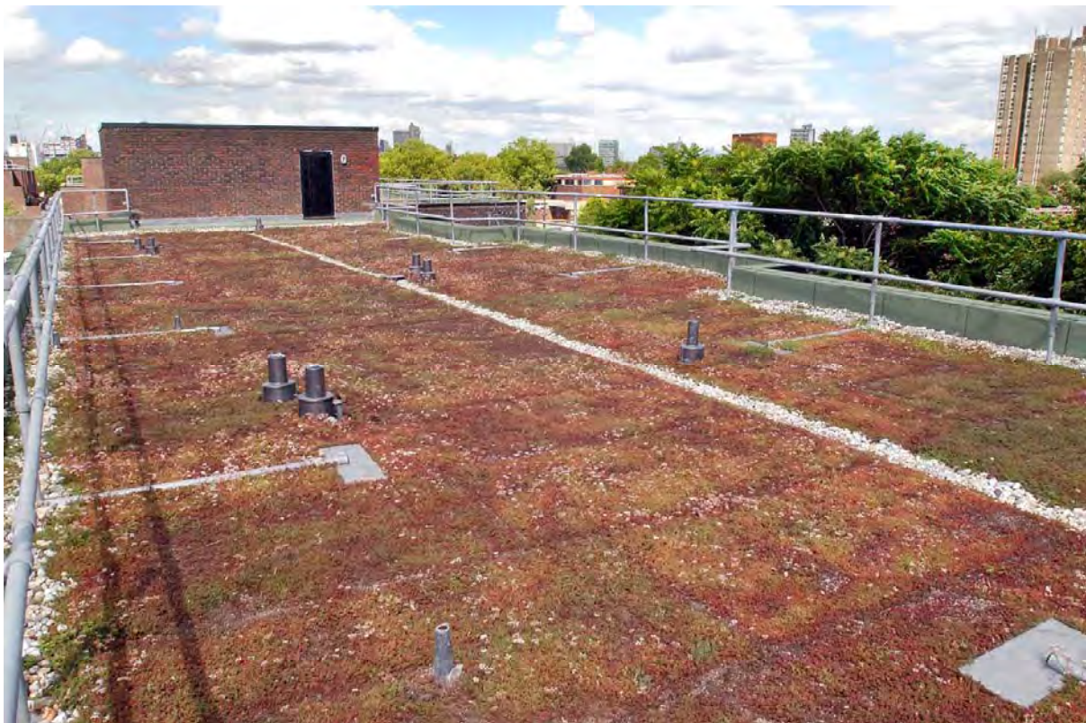
Plate 7. A mixed sedum species green roof on top of the Ethelred Estate in Vauxhall, which provides local biodiversity, flood mitigation and urban heat cooling benefits

Areas of Lambeth that are rich in natural vegetation and habitats, because they are recognised and protected for their biodiversity value, also play a vital role in helping reduce the risk and damage caused by surface water run-off and flooding, which is a constant concern for all of the borough’s residents, visitors and businesses.