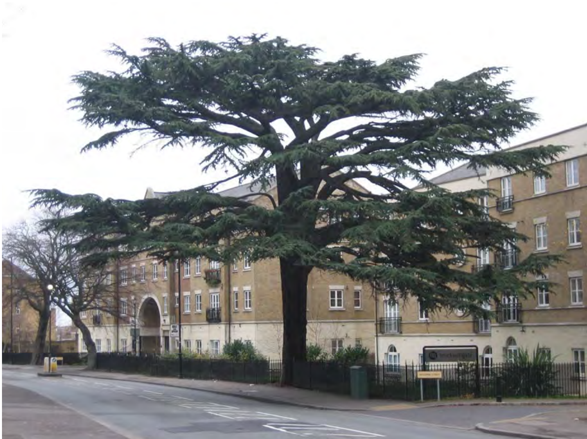
Plate 81. A magnificent mature Cedar of Lebanon on Tulse Hill Estate

Trees and woods provide valuable 'breathing spaces' for people in a heavily urbanised and densely built-up environment. For many of Lambeth's residents the borough's parks, commons and woodlands are the only accessible green space they might have, as well as providing shelter and shade from hot, sunny, wet or windy weather conditions.