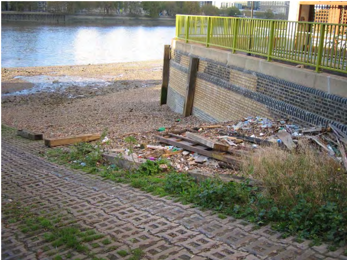
Plate 76. Lack's Dock near Vauxhall Bridge; the accumulation of litter dumped or lost in to the River Thames is another issue which can affect its ecological quality

Sewage, Storm Outflows and Poor Water Quality. Water quality standards in the River Thames have steadily improved over the last 150 years, but Greater London is still heavily dependent on its old and ageing Victorian sewage network. During periods of heavy rain, combined sewer overflows discharge diluted sewage and rainwater into the Tidal Thames, which under conditions of low river flow, heavy rain and warm weather can lead to a collapse in dissolved oxygen levels in the water and subsequent fish kills.