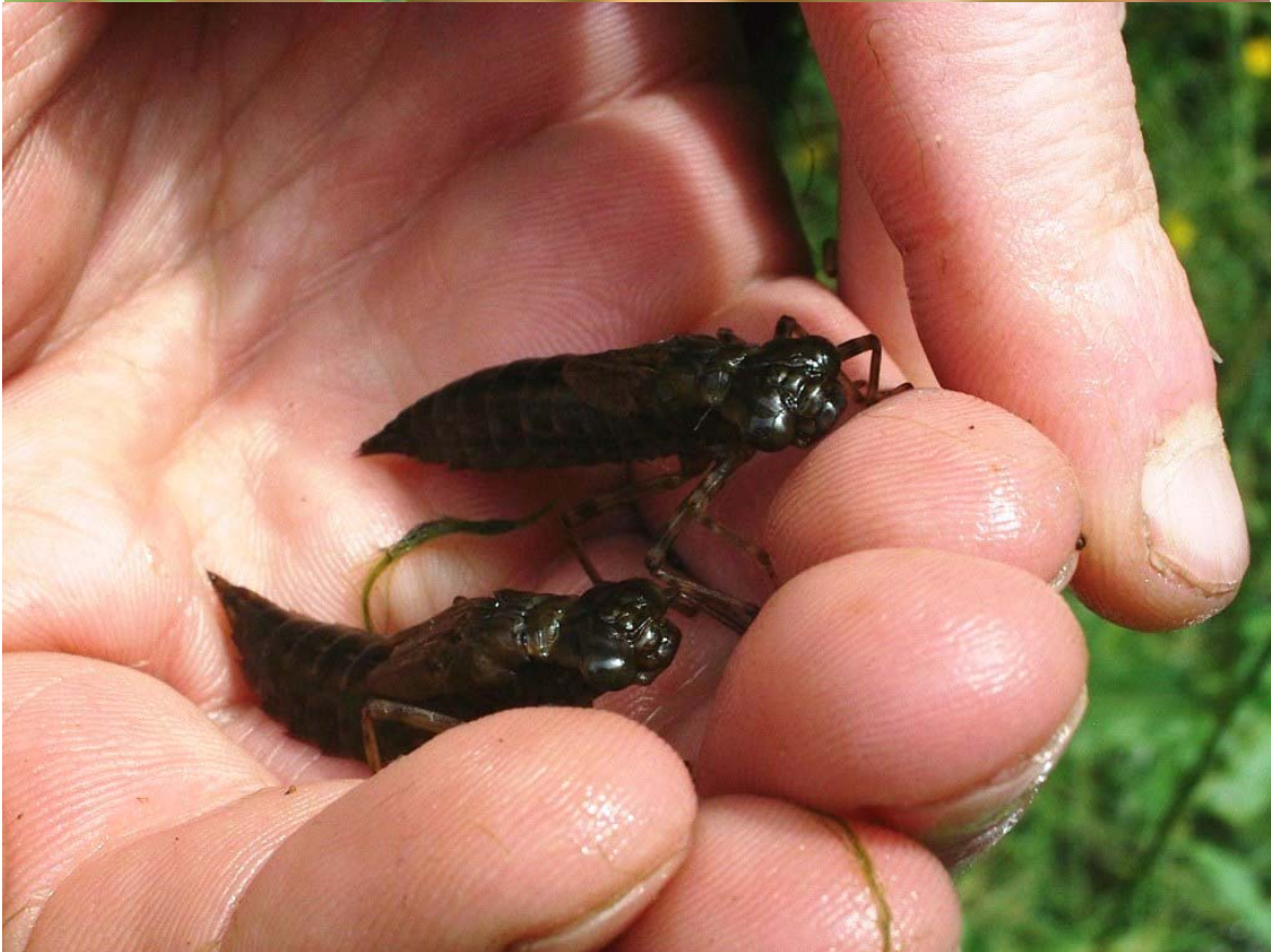
Plate 68. Adult and juvenile dragonflies, species which have benefitted significantly from improved ecological management of Lambeth's ponds and open water bodies