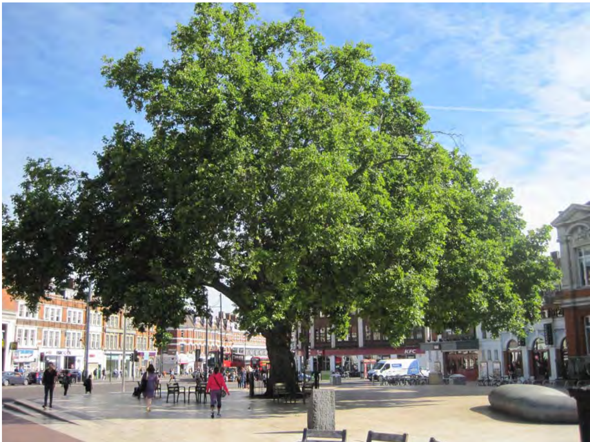
Plate 85. A mature London Plane on Windrush Square in the very heart of Brixton – a vital part of Lambeth's 'green lung' as well as a unique heritage and landscape asset

There are thought to be over 150,000 individual trees in Lambeth, with at least 70,000 being owned and maintained by Lambeth Council, found on streets and pavements, or in parks, cemeteries, housing estates and school grounds. Many of the other trees are found in private gardens, in business estates, on railway and other operational land or in hospitals.