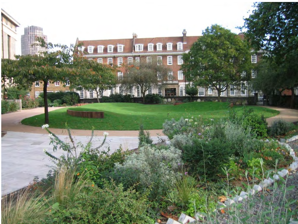
Plate 25. View of St. John's Church Gardens, a small closed churchyard in Waterloo that has been transformed into a unique wildlife haven and a community asset

As a consequence, coupled with a more 'relaxed' management style, this gradually resulted in a range of habitats in many of Lambeth's cemeteries and churchyards including meadow and species rich neutral grassland, woodland, scrub and even some areas of wetland.