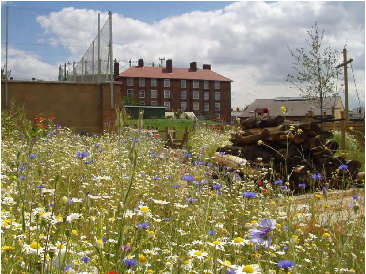
Plate 9. Cornfield annual wildflowers in the grounds of St. Mark's CE Primary School

The Lambeth BAP helps make the borough a better place for wildlife as well as for its residents and communities. Protecting and improving Lambeth's biodiversity contributes positively to people's quality of life by providing opportunities for learning, physical activity or quiet contemplation. It also plays a role in securing the future of the borough by cleaning our air, helping reduce the effects of flooding or excessive surface water flows, and to mitigate for the impacts of climate change. The principal ways that it does this are summarised below.