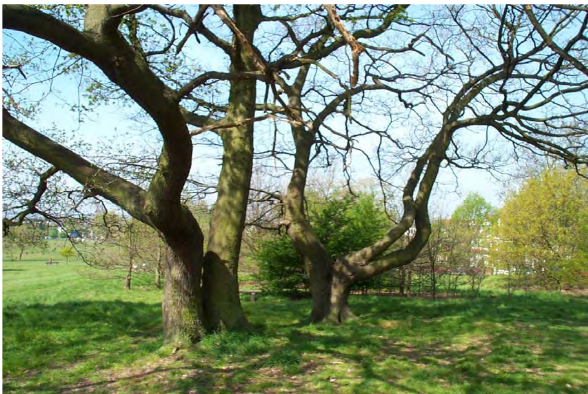
Plate 97. A diversity of tree species and ages on Streatham Common

2.18 (Green infrastructure); 5.9 (Overheating and cooling); 5.10 (Urban greening); 5.12 (Flood risk management); 5.13 (Sustainable drainage); 7.5 (Public realm); 7.14 (Improving air quality); 7.18 (Protecting open space and addressing deficiency); 7.19 (Biodiversity and access to nature); 7.21 (Trees and woodlands).