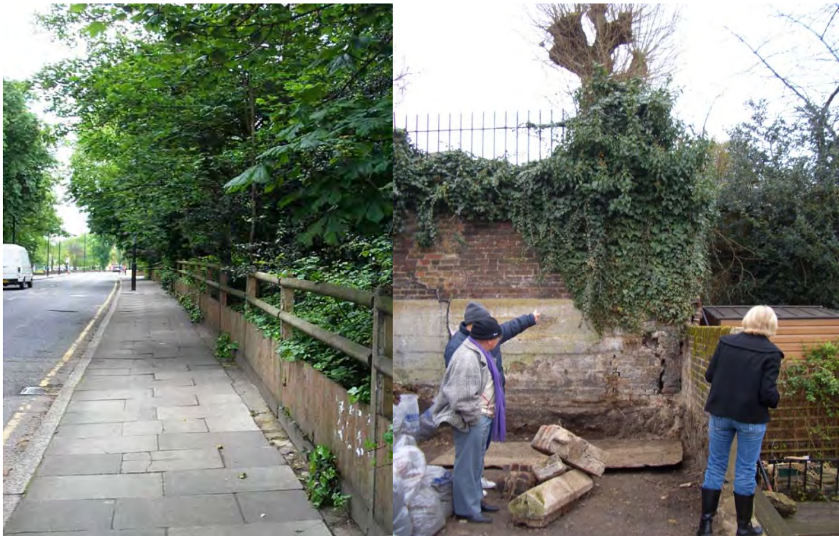
Plate 87. Trees overhanging a major public highway and pavement, and a tree allegedly causing damage to a listed wall – two reasons why removing the tree can be seen as a quick and easy solution to 'removing the problem'

Avoiding or Removing Liability and Financial Losses. Trees on the highway, housing estates or in communal gardens can be viewed as a potential liability to be removed or avoided. Examples include trees being blamed for causing subsidence on roads or in people's homes, blocking views for street lighting and CCTV, causing nuisance from leaves in gutters or blocking satellite reception, and creating trip hazards or other accidents.