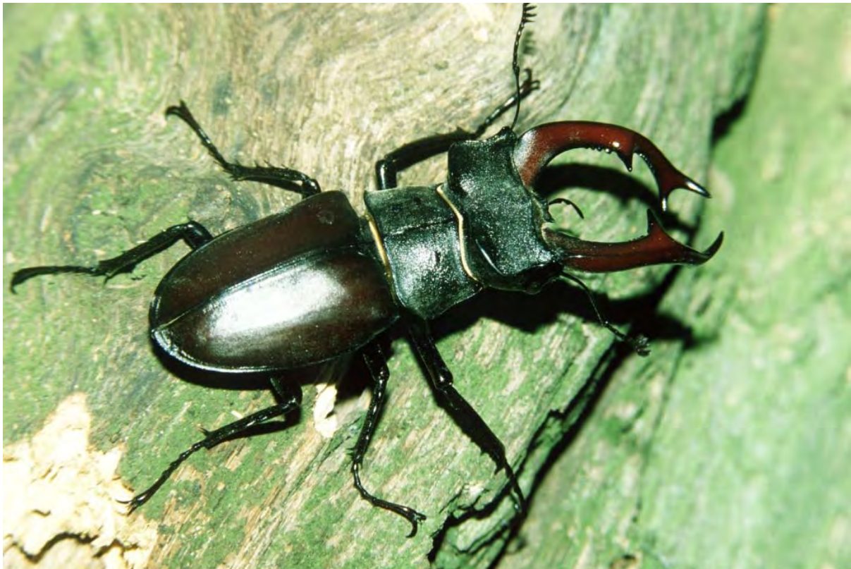
Plate 92. A male Greater Stag Beetle ( Lucanus cervus ); frequently recorded in Lambeth and its known habitats are fully protected through local planning policies

Many animals using trees, woodlands and any marginal habitats including trees like hedges and boundary habitat, for travel, shelter, feeding, nesting or breeding are protected by wildlife legislation. Examples include bats and birds, invertebrates like stag beetles, and even amphibians like great crested newts, where the land or woodland is wet and contains ponds and streams.