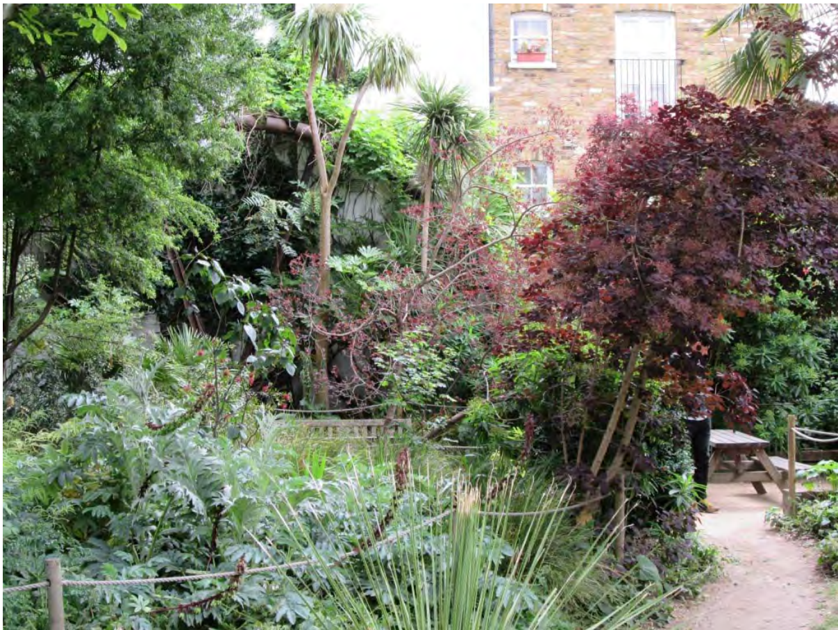
Plate 15. The gardens at Bonnington Square in Vauxhall, an important wildlife site which is also within one of Lambeth's newest 'Conservation Areas'

Many of Lambeth's conservation areas contain sites and features of considerable importance for biodiversity such as mature or veteran trees, extensive gardens, ponds, allotments or monuments. All of these provide valuable wildlife habitat, and many buildings in a conservation area contain features offering protected species like bats, birds and certain invertebrates places to roost, nest or feed.