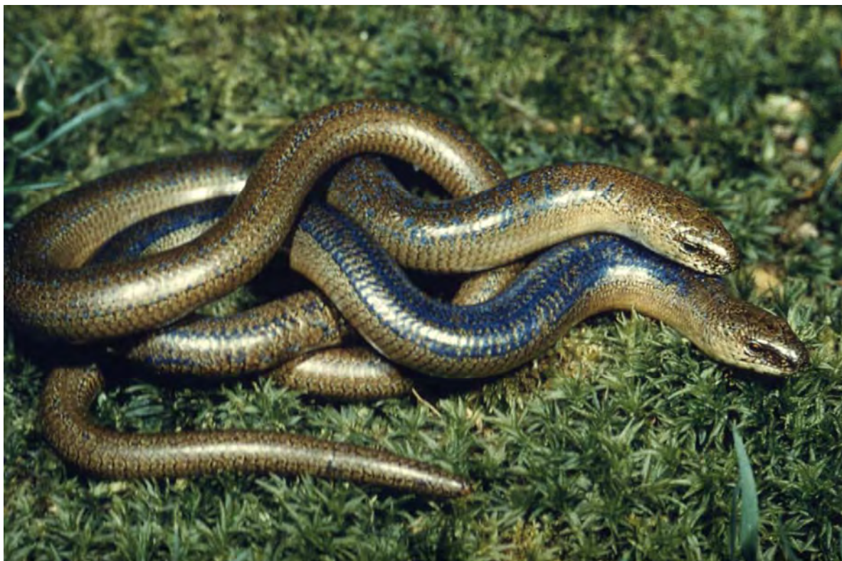
Plate 54. Male and female slow worms, a species frequently recorded or seen on open railway lineside habitat and scrub in Lambeth

Although this removal of trees might be seen as potentially harmful to the biodiversity of railway linesides and the borough, if done appropriately and sensitively it provides positive benefits. A mosaic of scrub, grassland, bare ground and trees, all of differing height, density and species, offers a high diversity of habitats and microhabitats, and different microclimates, which favours an equally high diversity of important wildlife like invertebrates, reptiles, amphibians, small mammals and birds.