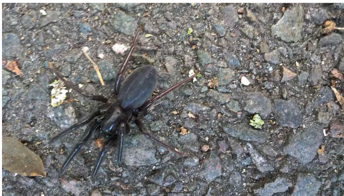
Plate 29. A female Tube Web Spider ( Segestria florentina ), a species often associated with acid grassland habitat, recorded on a tarmac path on Streatham Common

Acid grasslands in London are extremely important for their distinctive invertebrate populations, particularly insects and spiders. This is due not just to the specific grass and nectar-rich flower species which are present on acid grasslands, but also the loose and often bare soils, plus the dry and sun-exposed aspect of these grasslands. Many of the invertebrates that occur in acid grassland are specialists, and a number are rare such as many field crickets, some of which are UK BAP priority species.