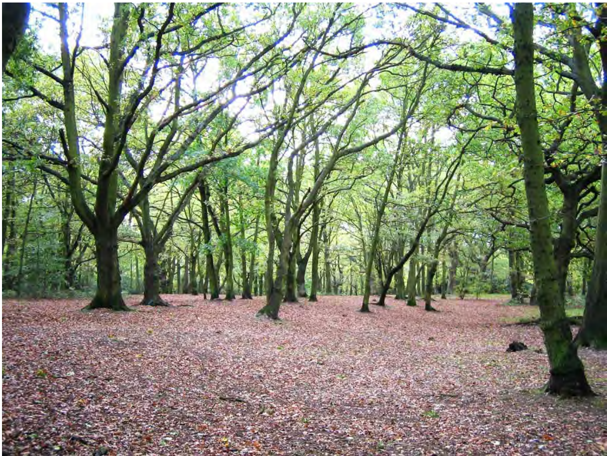
Plate 86. A view into the woodlands at the top of Streatham Common; these woods are secondary woodland which has recovered from previous historical clearance

Virtually all of the woodland currently found in Lambeth is believed to be 'secondary woodland'; sites which had been cleared of older 'primary' or 'ancient' woodland centuries ago and then used for other purposes, or which were never actually wooded. New woodland then naturally developed on the site following abandonment for farming or pasture, or was encouraged through tree plantings alongside a relaxed management style.