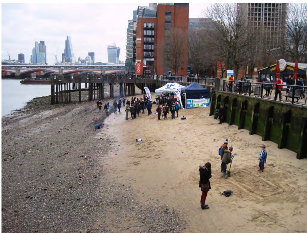
Plate 79. A Thames 21 event held on the foreshore to launch a new 'River Watch' scheme for local residents to monitor water quality on the Thames

2.18 (Green infrastructure); 5.12 (Flood risk management); 5.13 (Sustainable drainage); 7.5 (Public realm); 7.18 (Protecting open space and addressing deficiency); 7.19 (Biodiversity and access to nature); 7.24 (Blue Ribbon Network); 7.28 (Restoration of the Blue Ribbon Network); 7.29 (The River Thames); and 7.30 (London's canals and other rivers and waterspaces).