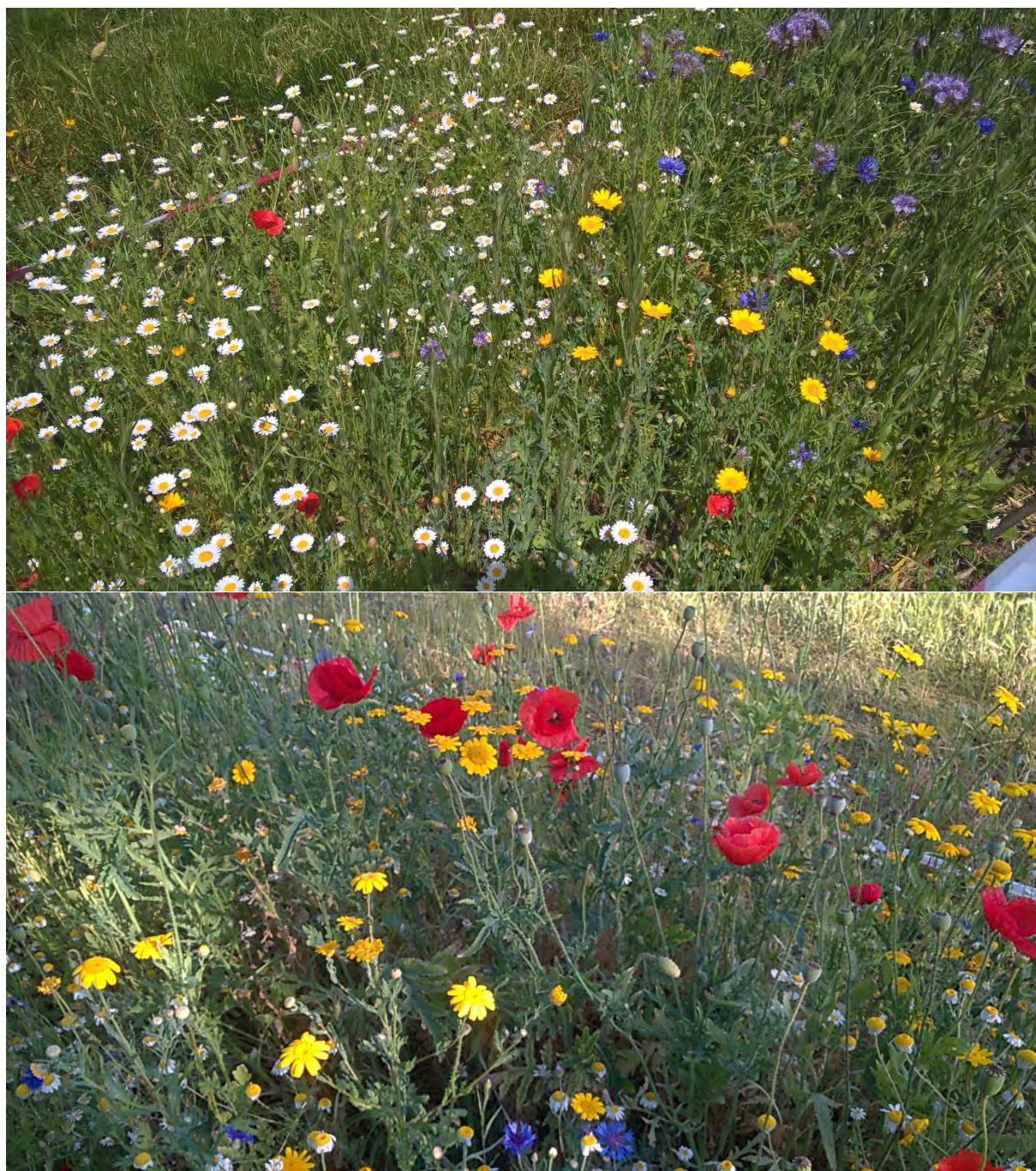
Plate 40. The end product for ‘Colour Your Common’; an incredible diversity of annual and perennial wildflowers in the very heart of Clapham Common