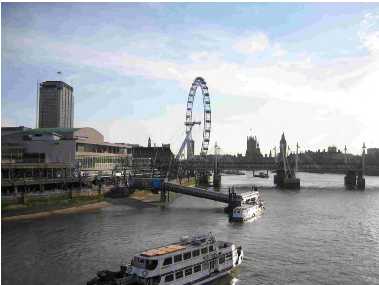
Plate 72. A view looking south west of the River Thames outside the South Bank Centre, Waterloo – probably one of the most iconic views of the Thames in London

The River Thames has been and still is a major transport route, a drain for wastes and sewage, a view, a development site, a historical record, a home and a visitor attraction. However, it is also recognised and celebrated as an important biodiversity resource and wildlife corridor for Greater London and beyond. Numerous wildlife habitats and species are present along its entire length, and many are closely linked to London's identity, history and development.