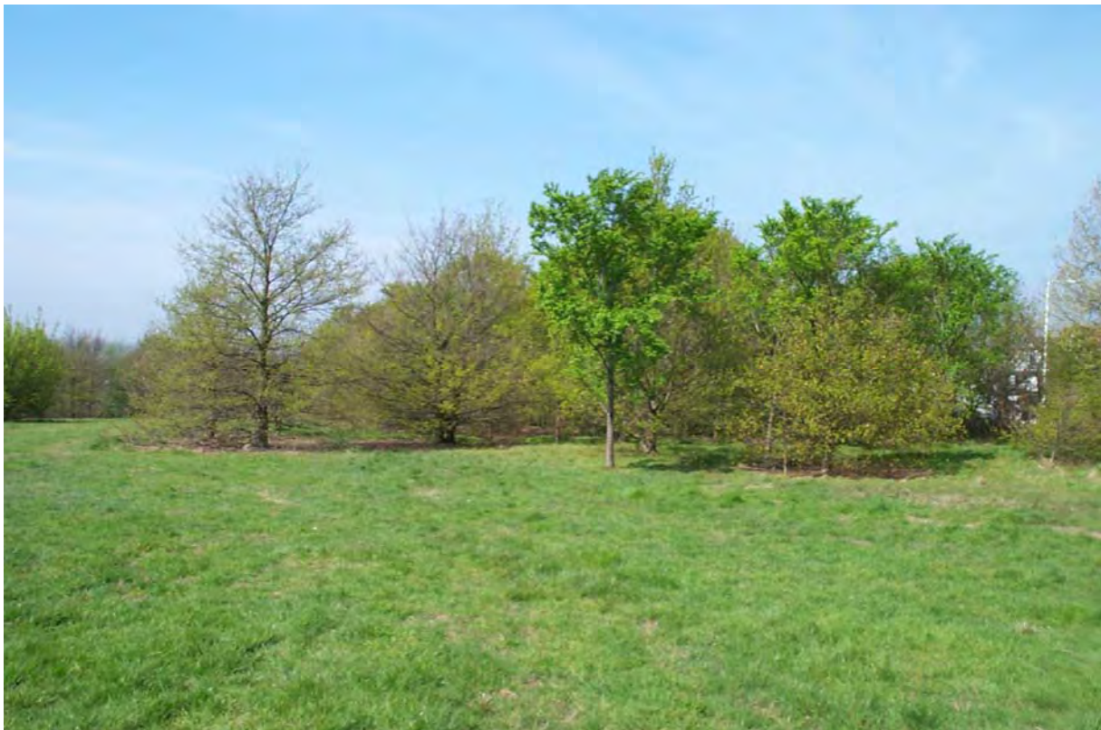
Plate 30. Acidic grassland habitat on Streatham Common; the encroachment of self-set tree saplings, bramble and thistles is a concern that needs attention

In the absence of grazing, mowing is the main means of maintaining the open character of acid grassland, but this is far from ideal as it can destroy features important for supporting diverse invertebrate communities, like anthills and tussocky grasses or scrub plants. It is also nowhere near as selective as grazing, as it cuts back many plants which may be important refugia or feeding resources for invertebrates and birds.