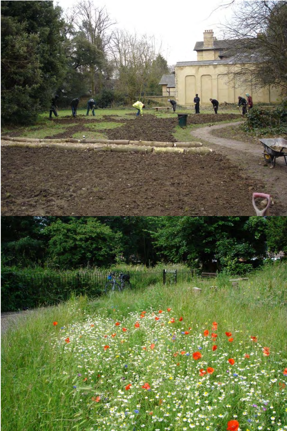
Plate 35. Corporate and community volunteers creating a new wildflower meadow in Palace Road Nature Garden, winter 2016; the end results in summer 2017, with a diversity of native grasses and annual/perennial flowers