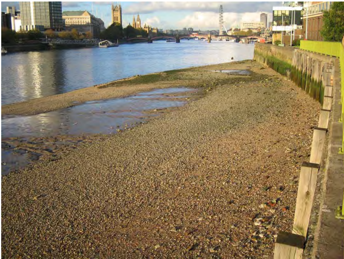
Plate 74. A view of the River Thames at low tide looking north, highlighting the wooden fenders which line large sections of the walls of the river within Lambeth – an important wildlife microhabitat, especially for plants, invertebrates and molluscs

The diversity of different materials used to construct sea walls and defences of the Thames within Lambeth, and the variety of materials deposited on the foreshore such as muds, sands, gravels and decomposed aggregates, as well as concrete and wooden fenders or jetties (some of which are abandoned and gradually rotting into the river bed) is enormous. These provide an incredible diversity of microhabitats and microclimates for many wild plants and animals, which are able to exploit and tolerate the constantly changing conditions resulting from the tidal actions of the river and the changing practices of humans both past and present.