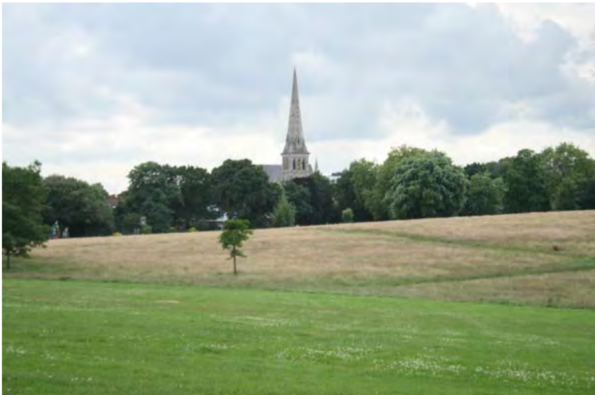
Plate 31. A south-west view across Brockwell Park, Herne Hill, showing the contrast between an area of amenity grassland in the foreground, and a more extensive area of species-rich meadow grassland on the upper slopes of the park

There is now a growing and widely supported move towards the conversion of areas of amenity grassland in public open spaces to a more 'relaxed' or 'naturalised' form of grassland management, that is much better for biodiversity and landscape effect. Although some people feel that this is being done as a cost-saving exercise, arguing that councils are saving money by cutting the grass less and leaving it longer, this is not always the main consideration.