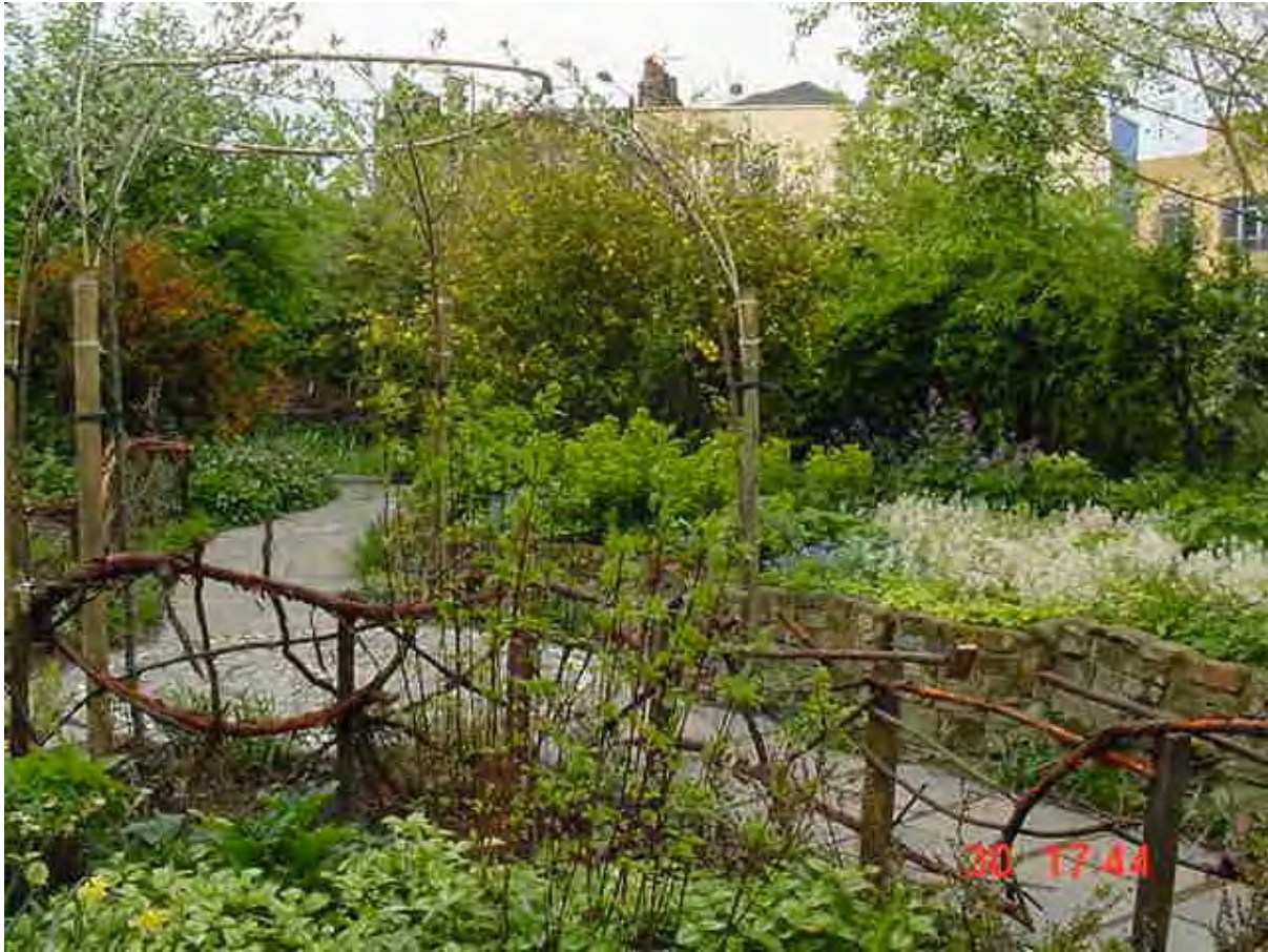
Plate 52. View of Harleyford Community Garden in Vauxhall, a well-used community greenspace, and a Borough Site of Importance for Nature Conservation