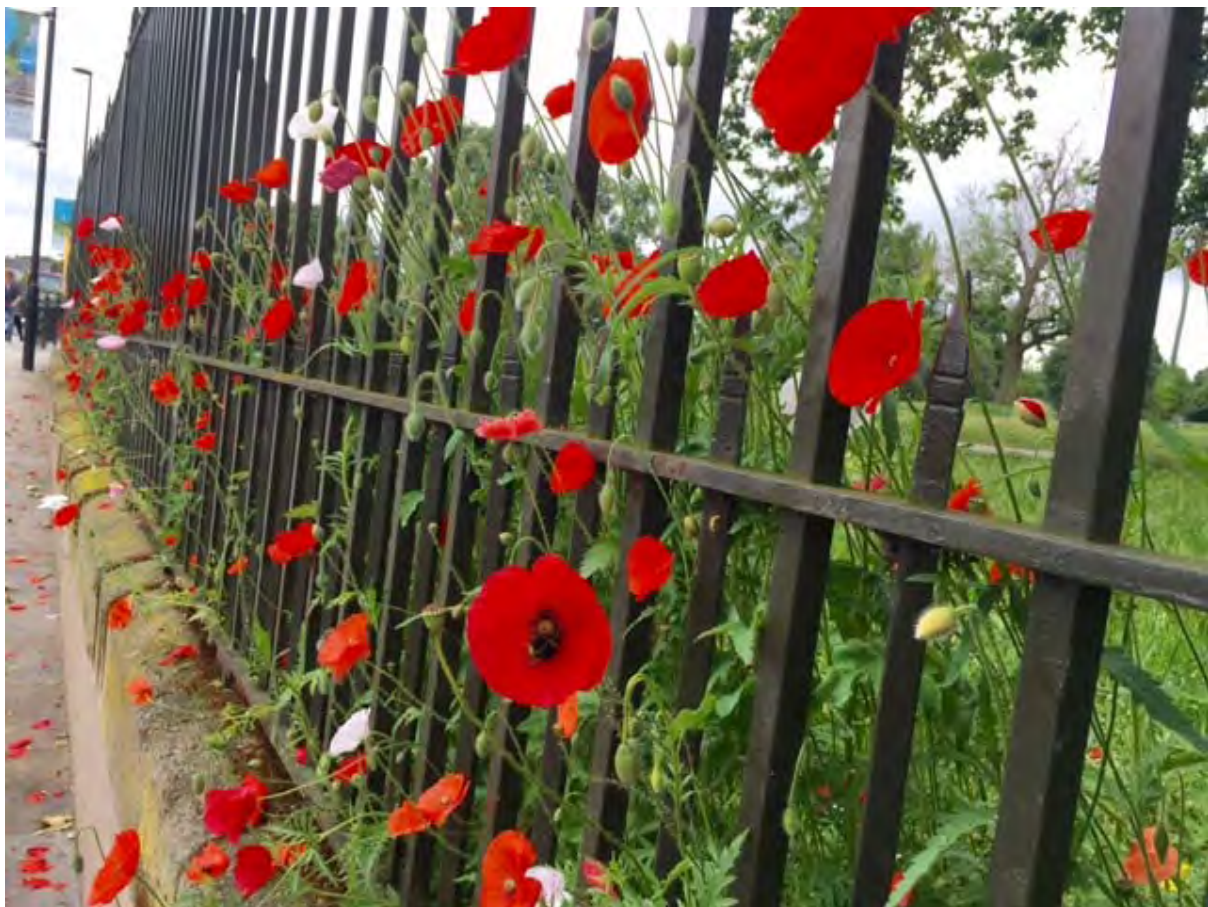
Plate 8. Field poppies growing through railings at Brockwell Park, adding some well-needed colour and wildlife diversity to a popular open space

The Lambeth BAP is designed to help deliver on these priorities. The most significant priority is undoubtedly the ability to help 'build strong and sustainable neighbourhoods' by protecting and improving places that local people and communities can safely use including for access to and enjoyment of nature where they live and work. Nature should be integral to every community and neighbourhood in the borough, and we want people to feel proud of and engaged with our local biodiversity.