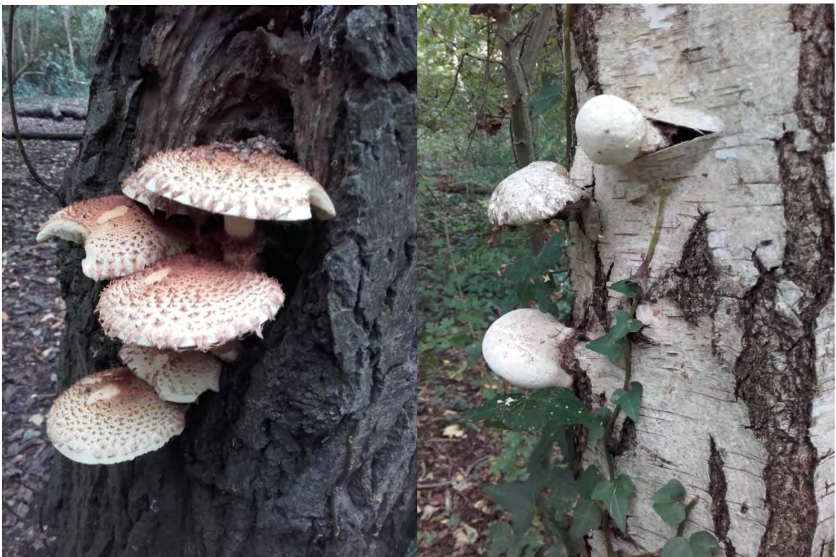
Plate 83. Fungi growing on poplar and beech trees within Eardley Road Sidings Nature Reserve, help recycle nutrients but also provide food and habitats for other species

Trees also act as 'scaffolding' for many wild plants that use them for support or to access light and nutrients. Ivy and wisteria, for example, provide many different wild animals with shelter, food and nesting habitat, especially invertebrates, birds and bats, and provide additional cover and protection from predators and human disturbance on the ground.