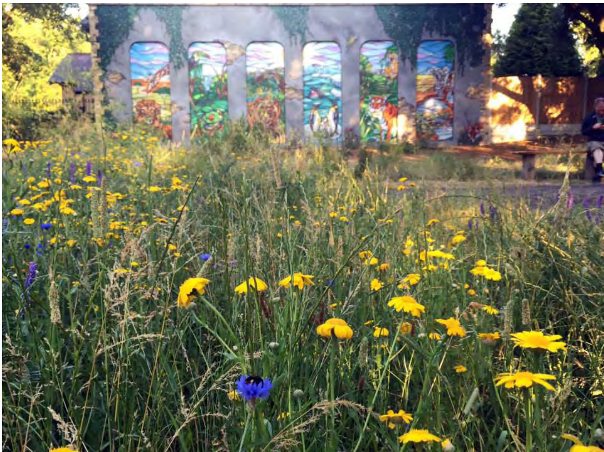
Plate 27. An annual and perennial wildflower-rich meadow in Palace Road Nature Garden, Streatham Hill, offset by a colourful community-designed and created mural

Alongside this we will work to identify and secure additional or new wildlife habitat within the borough's green spaces, especially in and around sites that are currently of low ecological value or where the public have poor or limited access to and enjoyment of nature where they live, work or study.