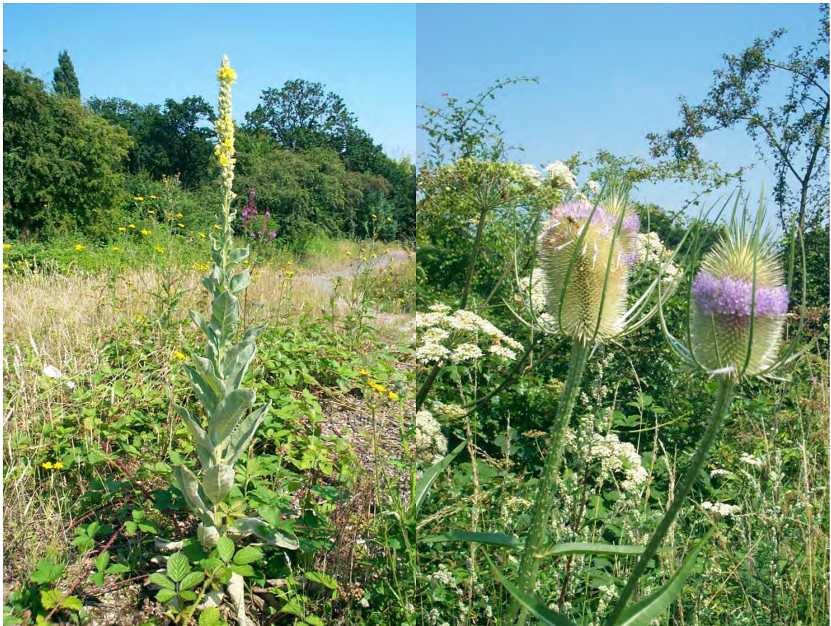
Plate 55. Common mullein and common teasel, two plants of significant importance for birds and pollinators, frequently recorded on railway linesides in Lambeth

It is still important to retain a proportion of mature and semi-mature trees on railway linesides, particularly in those parts of the borough which are relatively deficient in good and continuous tree cover, such as in central and north Lambeth, or where trees on railway land provide additional green corridors connecting nearby green spaces or other important habitats.