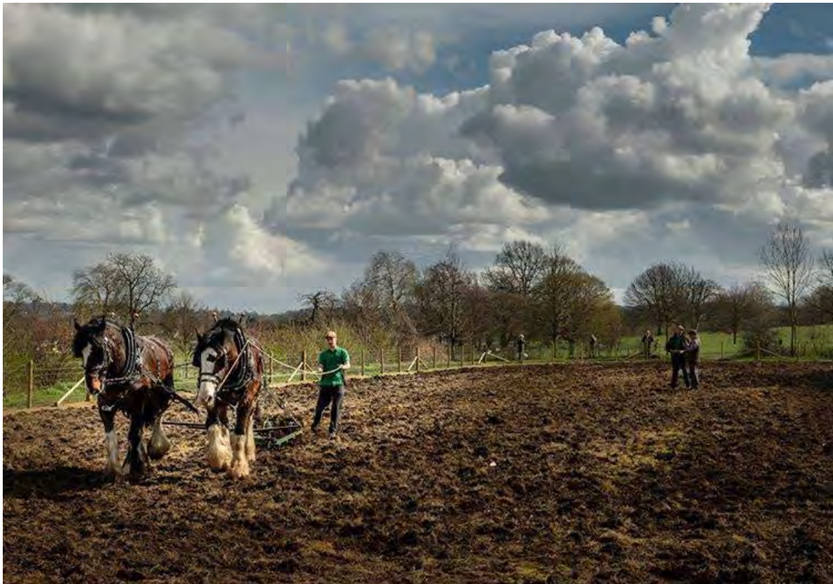
Plate 36. Shire horses from 'Operation Centaur', Richmond Park, ploughing over an old 'Redgra' football pitch in Brockwell Park, spring 2019, in order to create a new species-rich wildflower meadow with funding provided by SUEZ Environment Trust

We are committed through appropriate intervention and management, to increase the amount of meadow grassland, including wet meadow, in Lambeth's parks and public open spaces from 35 to 40 hectares by 2024. We will also increase the amount of wildflower species-rich meadow grassland from its current 10 hectares to 15 hectares in the same timeframe.