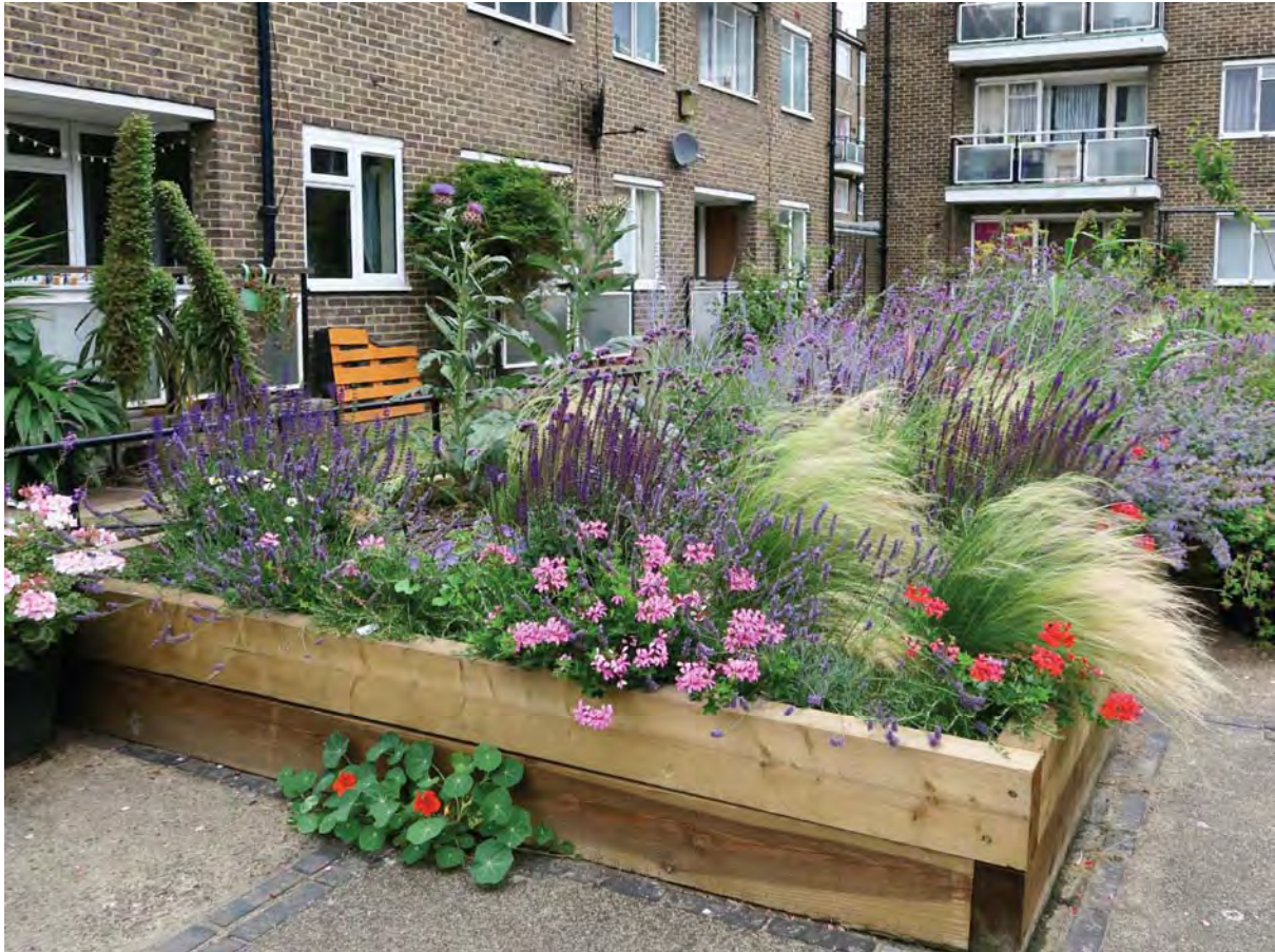
Plate 44. Communal garden within part of the Caldwell Estate, Stockwell, created by local residents and community groups to grow healthy food and benefit local wildlife

At one time allotments were primarily places provided for individuals to grow their own food but on land segregated into 'plots' of various sizes. Individual allotment ploholders were normally viewed by the public as focused on producing food for their own consumption and not communicating much with other ploholders or the 'outside world'.