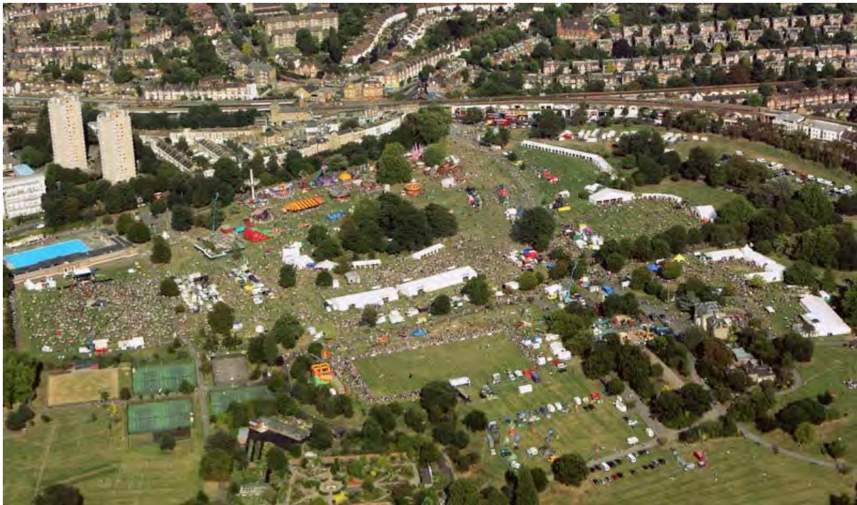
Plate 23. Aerial view of Brockwell Park, one of Lambeth's largest and busiest public open spaces, during the 'Lambeth Country Show' in July 2018

Lambeth's parks and open spaces not only provide people with numerous opportunities for relaxation, recreation and play, but also for them to observe and enjoy both landscapes and wildlife. They act as 'green lungs' for people living in our urban environment, whom for whatever reasons cannot live in or visit the wider countryside. Our parks and open spaces are also important in providing an 'environmental' element in the enrichment of the quality of our lives, giving immediate access to wildlife, a sense of environmental responsibility and promoting health and wellbeing.