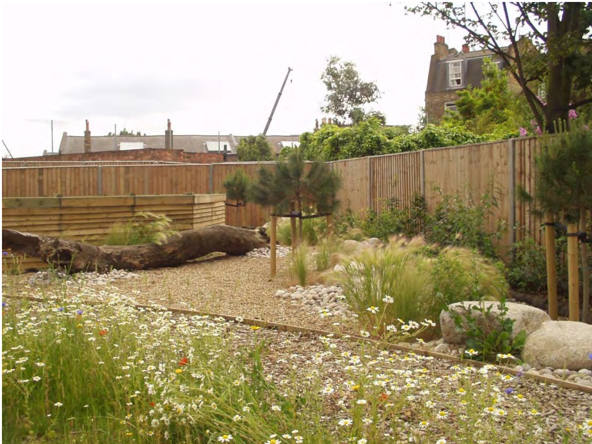
Plate 21. View of the grounds of St. Mark's CE Primary School in Kennington, showing the diversity of ground cover habitat within a school environment

Lambeth's built environment will make a progressive and positive net contribution to the borough's biodiversity and green infrastructure, through the inclusion of features such as biodiverse living roofs and walls, along with exterior and public realm landscaping that incorporates a significant biodiversity element.