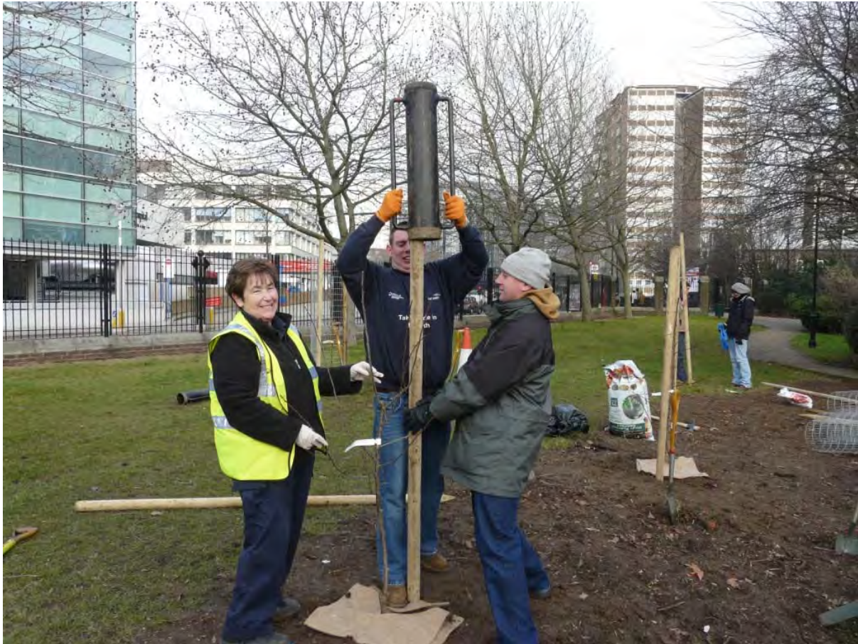
Plate 96. Staff from Lambeth's Landscapes team planting a new community orchard in Archbishop's Park to increase tree cover and biodiversity in the north of the borough

Native tree cover/content, as a proportion of an individual woodland site's total tree population, will be maintained and progressively increased by 5% by 2024, through appropriate tree management and planting. Priority is given to trees in those parts of the borough where there is a net deficiency in tree cover or accessible woodland cover is low.