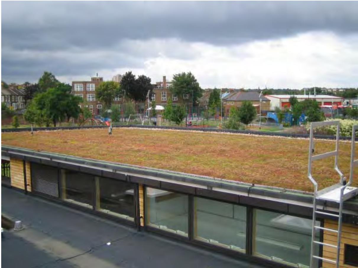
Plate 18. Part of the living roof on the Michael Tippett School, Herne Hill, which is still one of the largest green roofs on any school building in Greater London

The London Borough of Lambeth is predominantly urban in nature and is characterised by numerous buildings, roads, pavements and other hardstanding areas, all of different sizes, shapes, heights and materials. Buildings can include private and social housing, individual roofs and walls, as well as school grounds, housing estates, streets and the wider public realm.