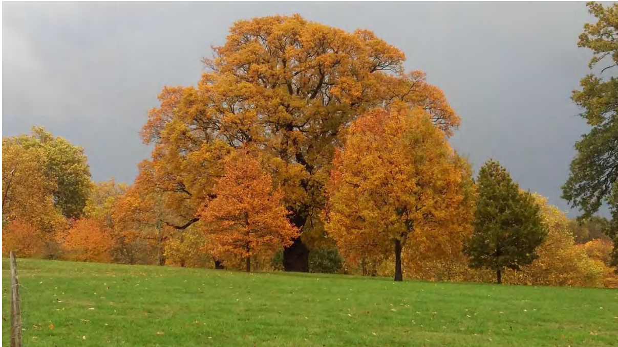
Plate 84. Autumnal colours on trees in Brockwell Park, which all adds to the value of Lambeth's parks and public spaces as places of tranquillity and relaxation

Woodlands of differing sizes and complexity are often seen as places to visit and are used to get away from the pressures and demands of urban life; they offer some seclusion and peace to walk, walk the dog or just relax, provided that the woodlands are appropriately managed to mitigate for any access, safety or security issues.