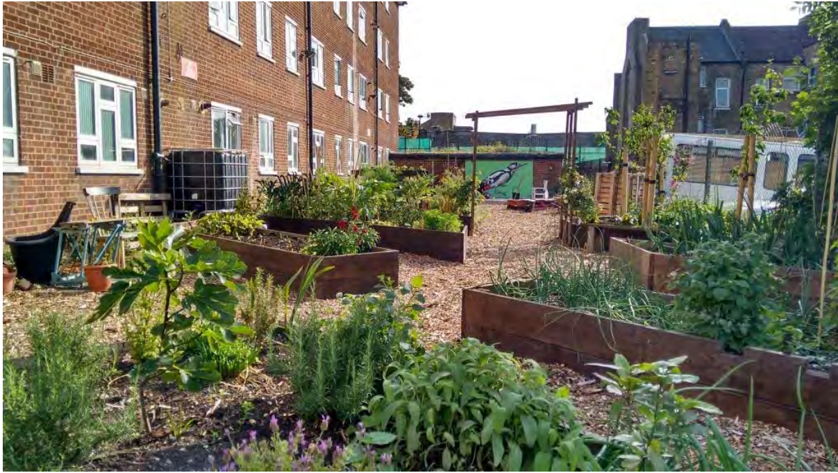
Plate 11. A mature wildlife-rich rain garden on the Southwell Estate in Herne Hill, funded through the 'Lost Effra' flood awareness and mitigation project in 2017