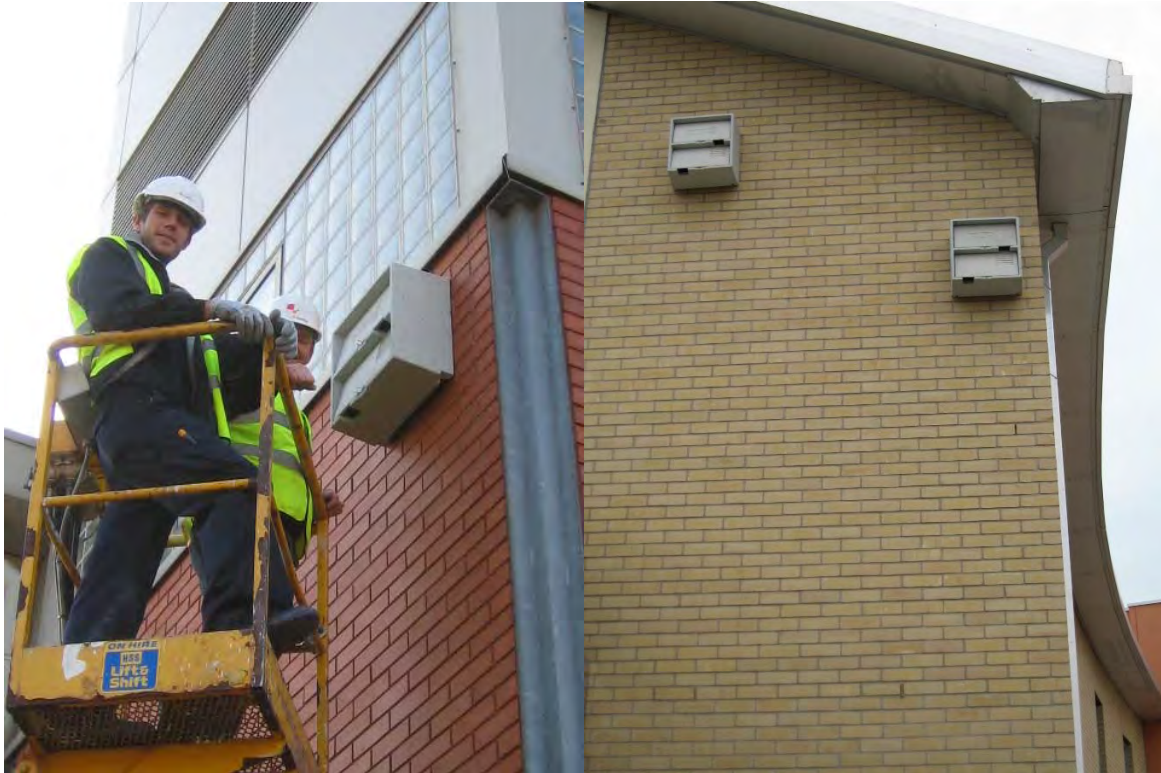
Plate 20. Erecting combined swift and bat nesting boxes on buildings at Lambeth Hospital, Landor Road, in partnership with South London & Maudsley NHS Trust

Lambeth is committed to protecting all of its biodiversity, and this includes that living in and depending on its built environment. This means working to protect what wildlife we have in the more built up parts of the borough from inappropriate development or loss. It also involves looking for opportunities across Lambeth's built environment to secure new wildlife habitat, especially on and around either new or existing buildings or public realm developments.