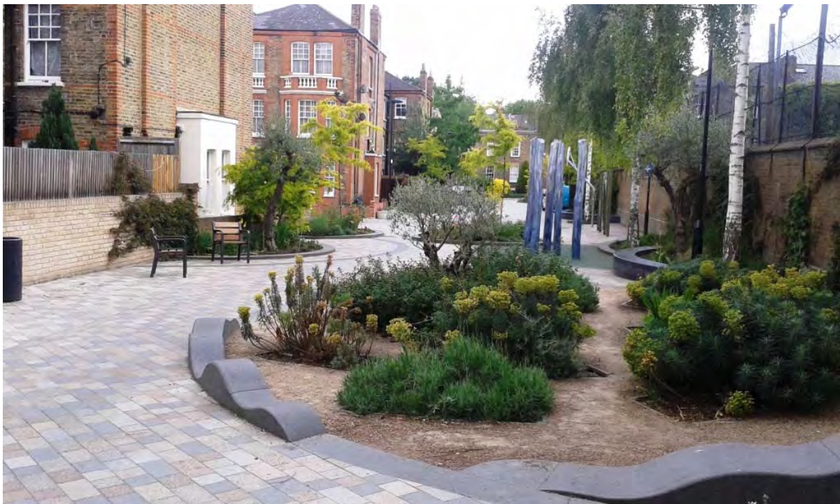
Plate 13. Part of Van Gogh Walk in Stockwell; creating pedestrian-friendly public realm has also created a wildlife-friendly ecosystem accessible to the wider public

Well managed and maintained natural green spaces can store and then gradually release water, whether from vegetation, surface and ground water, which helps to reduce ambient air temperatures, which then reduces the urban heat island effect.