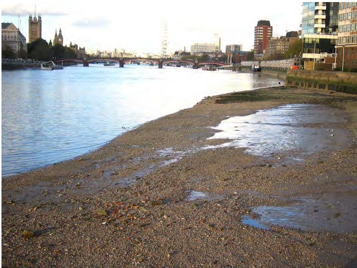
Plate 73. A view of the River Thames at low tide looking north, highlighting the extensive banks of shingle, gravel and mud, of critical importance for wildlife species

However, though relatively short in length, the section of the River Thames in Lambeth is one of the best known because of the many historical features and tourist attractions along the Albert Embankment and South Bank. The section of the Thames in Lambeth was once fed by the River Effra, but recent developments have obscured its route and it is now a buried or 'lost' river of London, with only a storm discharge outlet visible beside Vauxhall Bridge.