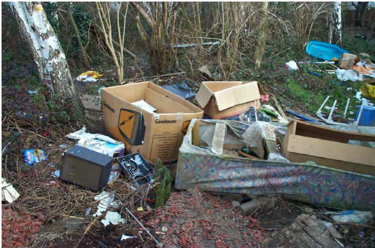
Plate 89. Historical flytipping in Eardley Road Sidings Nature Reserve, 2004; considerable effort has been spent on preventing future occurrence of this type

Vandalism and Antisocial Behaviour. Many woodlands in Lambeth are targets for vandalism or illegal dumping of household, industrial or building wastes. Flytipped waste smothers valuable woodland ground cover, introduces pollutants or invasive weeds, attracts vermin and discourages public use as the site becomes unsightly. Even trees in streets or on housing estates can be targets for vandalism, such as when people don't want one outside their home, see them as easy targets for causing damage or hit or run over them when reversing or parking cars and other vehicles without appropriate care or attention.