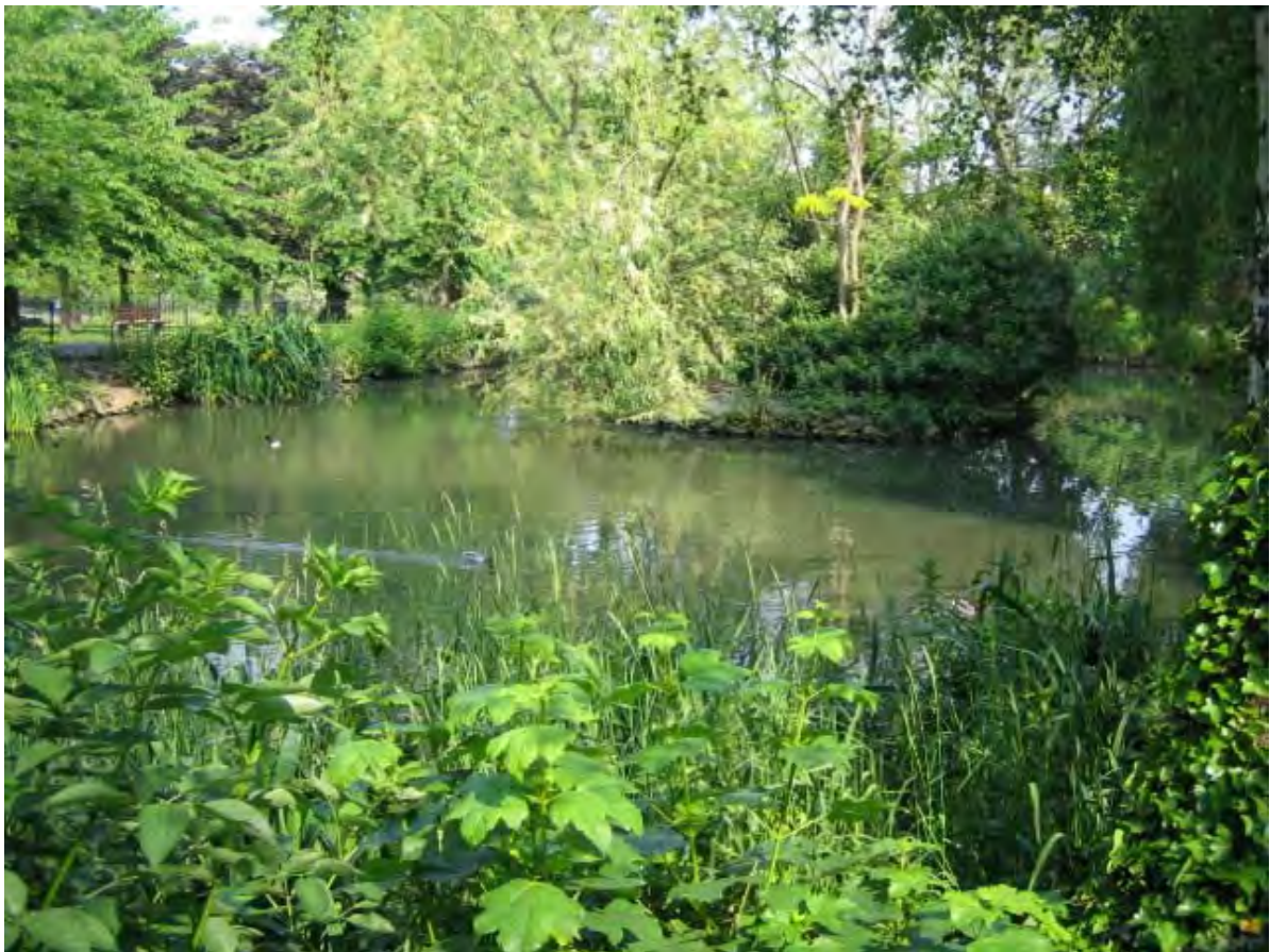
Plate 64. The main pond in Ruskin Park; a key landscape and ecological feature

Neglect and Lack of Management. Neglect or a lack of maintenance of rivers and ponds usually results in the forces of 'natural succession' taking over, with a loss of important aquatic and semi-aquatic habitats and species, and replacement by those typical of dry land.