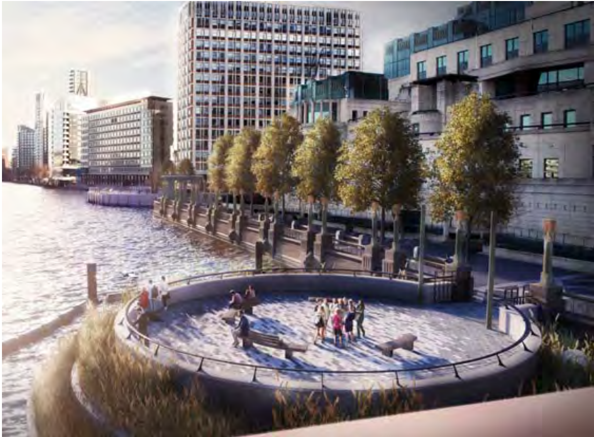
Plate 77. Artist's impression of the at new Thames Tideway CSO interception point on Albert Embankment beside Vauxhall Bridge, along with marginal estuarine reedbed habitat and a new viewing stage to improve managed access to enjoy the Thames