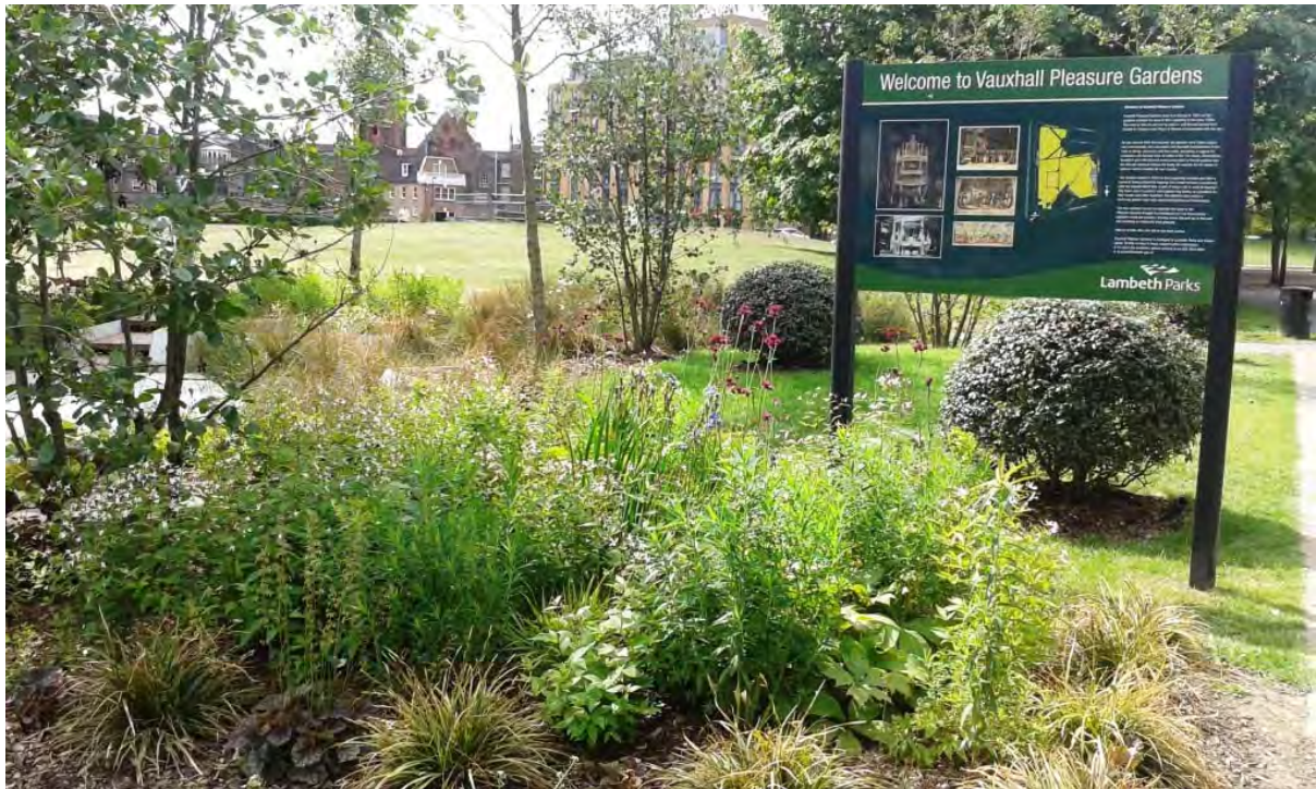
Plate 17. Vauxhall Pleasure Gardens, a proposed new Site of Importance for Nature Conservation based on the many ecological improvements delivered on site

We will work with our stakeholders and partners to undertake regular assessments of our wildlife sites, especially those covered by and integral to each priority habitat action plan, ensuring any field survey data or records are collated and submitted to GiGL. This ensures the information used to monitor the BAP's performance is based on best available data.