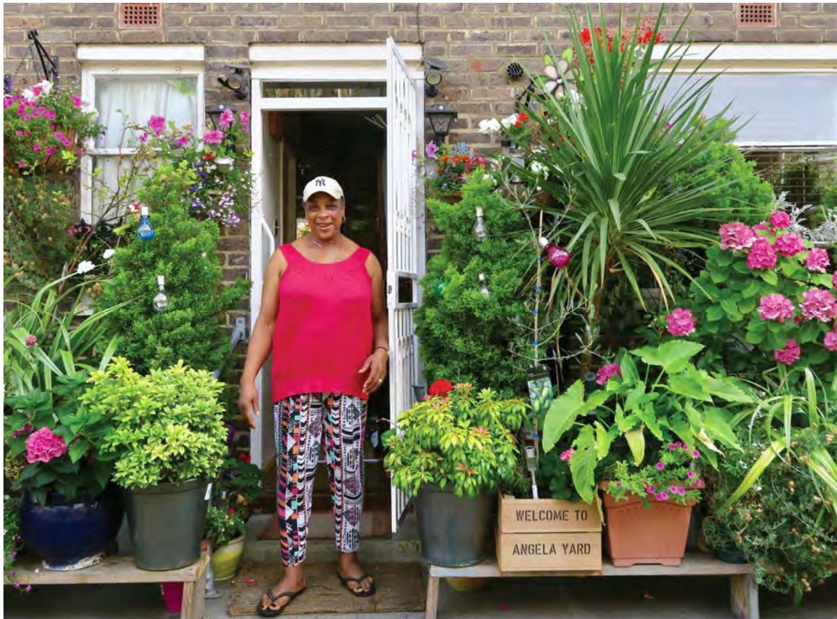
Plate 49. Front garden of a flat on the Caldwell Gardens Estate, Stockwell, showing what committed and enthusiastic residents can do for biodiversity and community