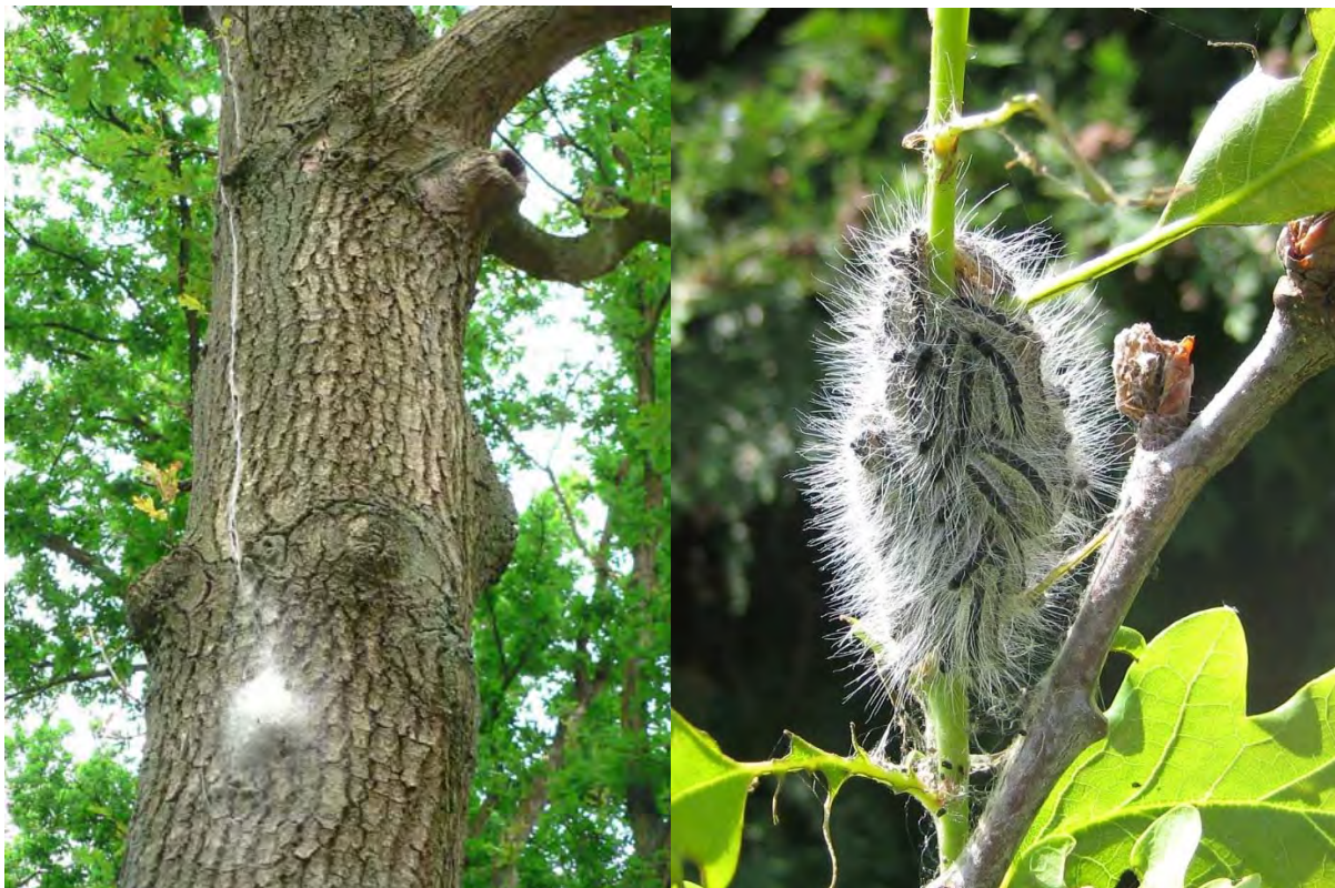
Plate 90. 'Nests' and caterpillars of the Oak Processionary Moth on oak trees – a new and growing threat to oaks in both woodlands and in open spaces across the UK

Other problems are being caused to trees, including in woods, by numerous insect pests, some of which have been introduced to the UK by poor quarantine or provenance controls for imported tree stock. Examples include the Asian longhorn beetle, box tree moth and its caterpillars, oak processionary moth and horse chestnut leaf miner moth.