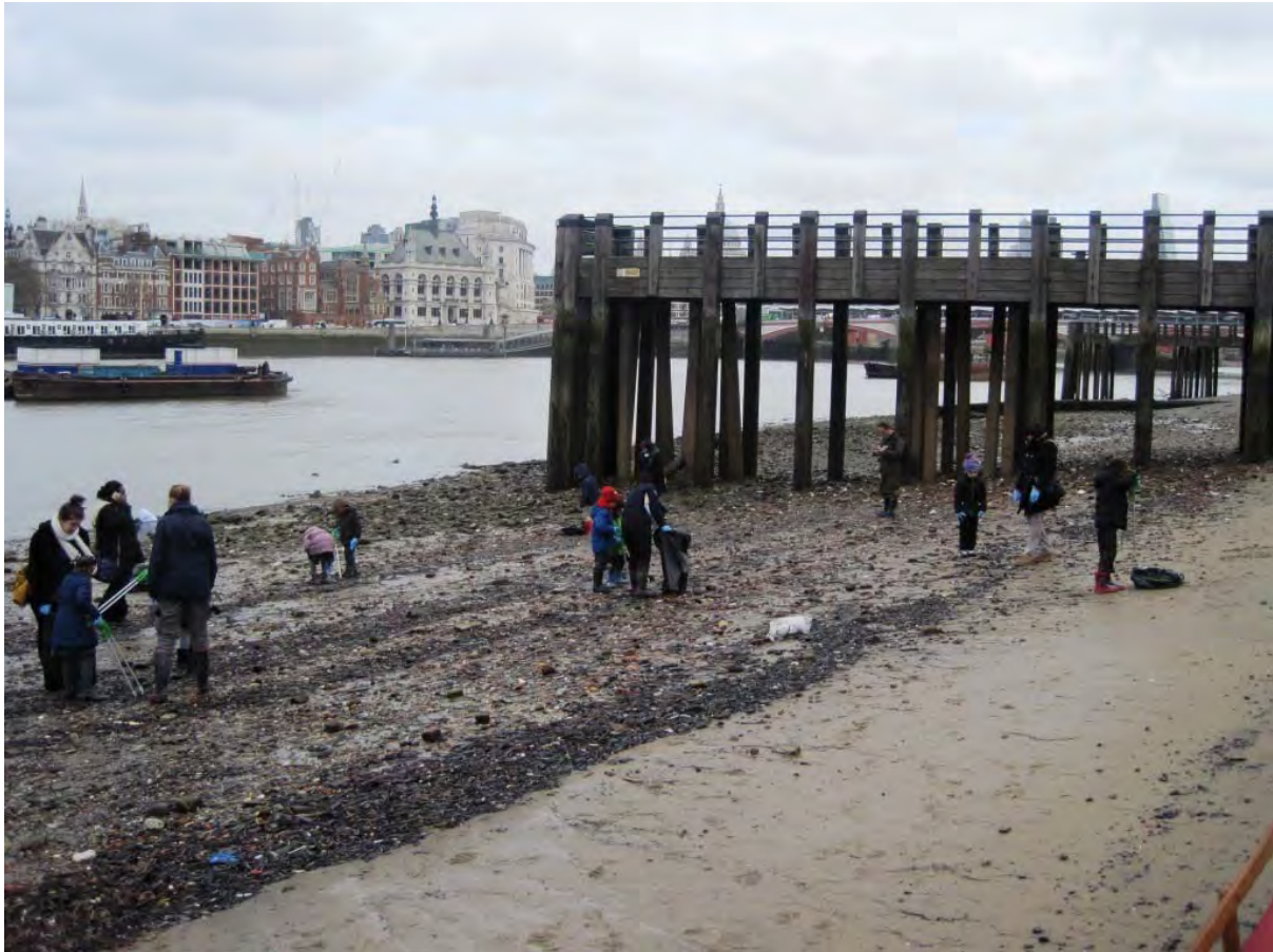
Plate 78. A community clean up event on the Thames foreshore below Gabriels Wharf in Lambeth, to help remove any litter but also re-engage the public with the Thames