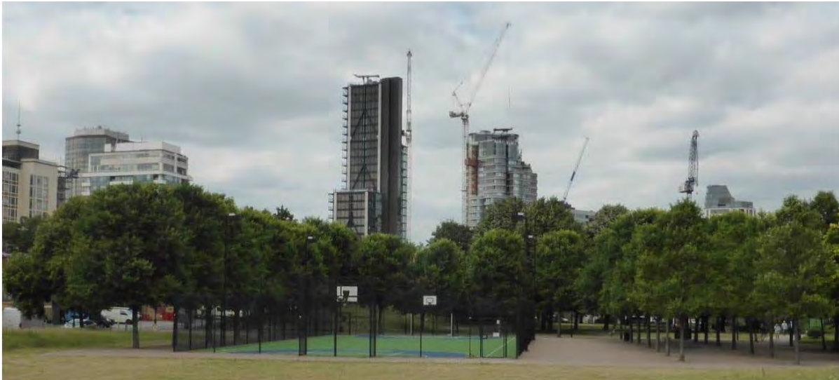
Vauxhall Pleasure Gardens – Ulmus 'New Horizon' with a colony of White-letter Hairstreaks, 23 June 2017