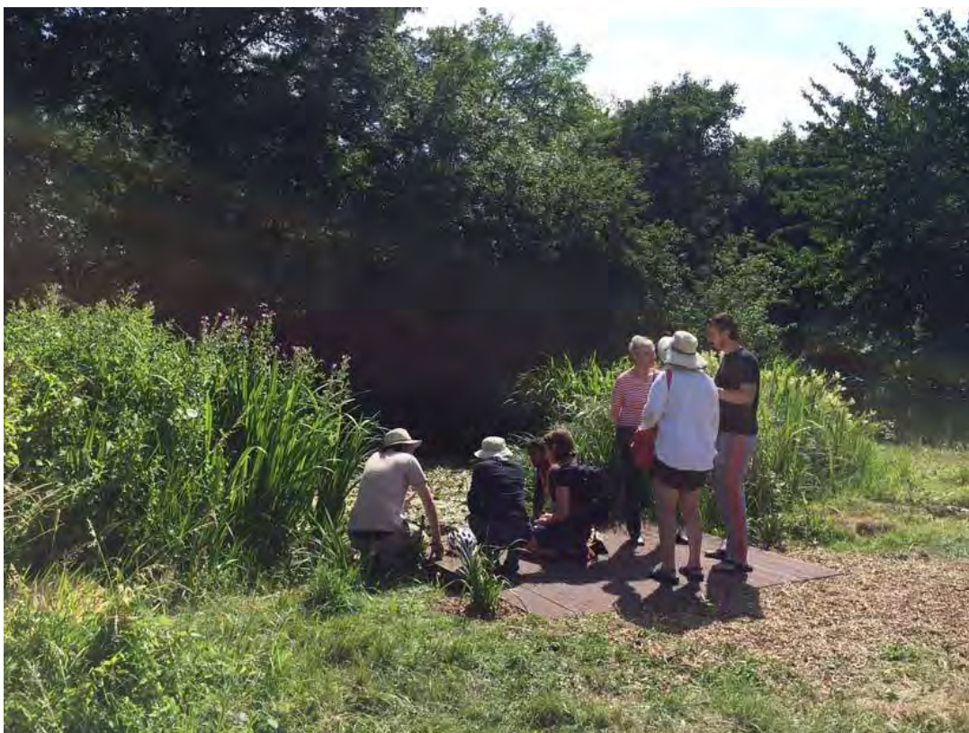
Plate 71. Volunteers relaxing by the side of one of the two wildlife ponds in Palace Road Nature Garden, Streatham Hill

2.18 (Green infrastructure); 5.3 (Sustainable design and construction); 5.9 (Overheating and cooling); 5.10 (Urban greening); 5.12 (Flood risk management); 5.13 (Sustainable drainage); 7.5 (Public realm); 7.17 (Metropolitan Open Land); 7.18 (Protecting open space and addressing deficiency); 7.19 (Biodiversity and access to nature); 7.21 (Trees and woodlands); 7.30 (London's canals and other rivers and waterspaces).