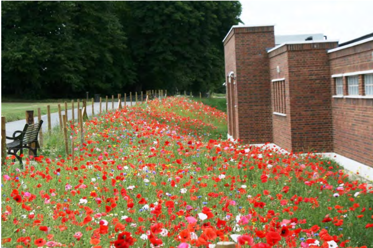
Plate 34. The 'Wildflower Lido Slope' in Brockwell Park, showing what can be done by converting an area of poor quality ground into a colourful wildlife attraction

Lambeth's parks and other public open spaces already contain areas that are specifically managed as meadow grassland, both as wet and dry habitat. Some are composed of many different species of wild grasses and other tall herbs, but are still of great importance to many wild animals typical of less intensively managed grasslands. These grasslands often show an abundance of many different species of invertebrate like grasshoppers, crickets, butterflies and moths, and are used by grassland birds such as grass warbler, skylark and dunnock.