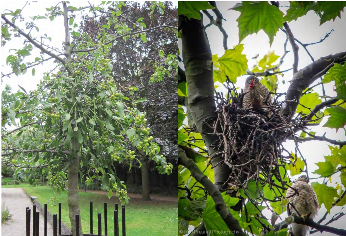
Plate 38. A mistletoe bush and a family of sparrowhawks in Archbishop's Park, Waterloo – beneficiaries of a more ecologically sensitive approach to managing Lambeth's parks and open spaces