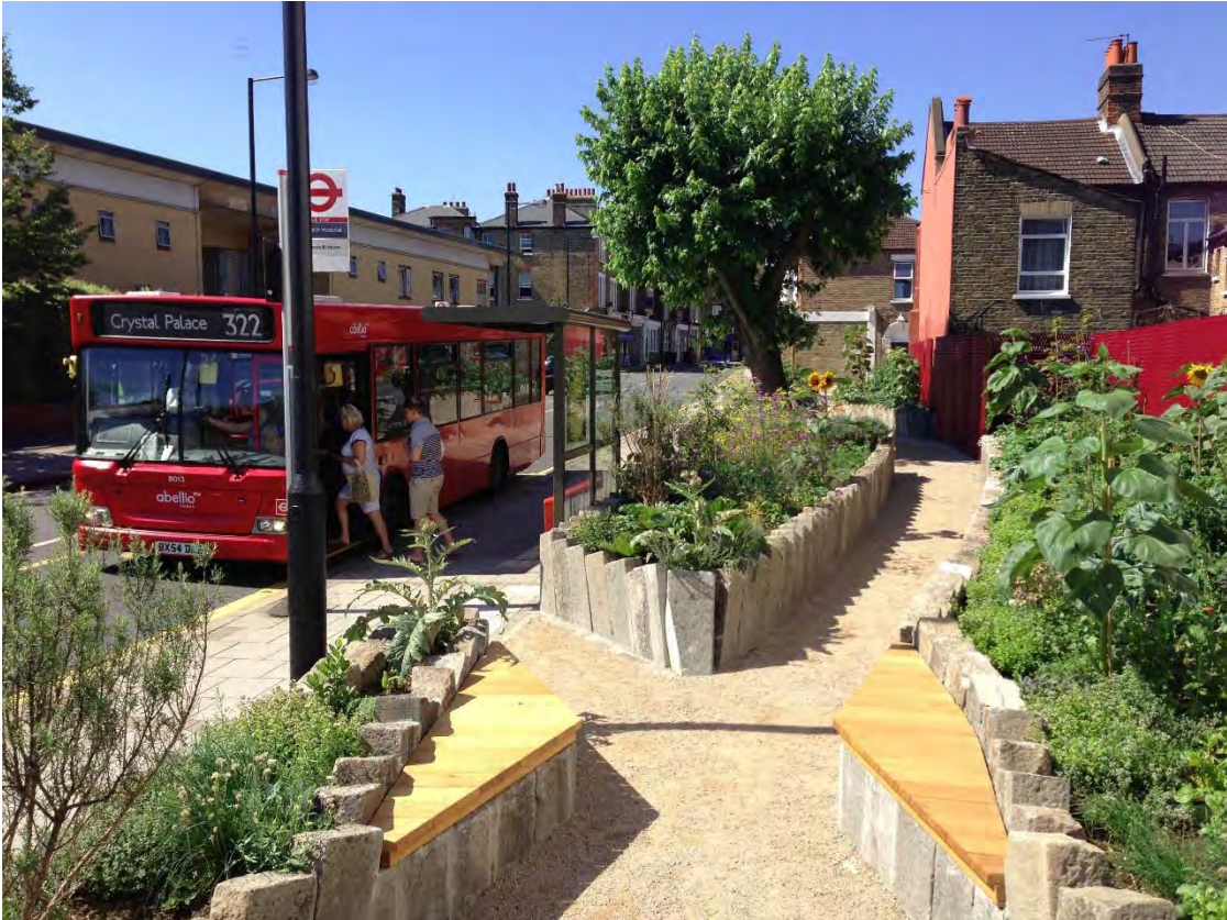
Plate 45. The 'Edible Bus Stop' on Landor Road, Stockwell – before and after; what a local community can do to convert a poor quality area of open space into a unique food growing opportunity that also has significant benefits for biodiversity