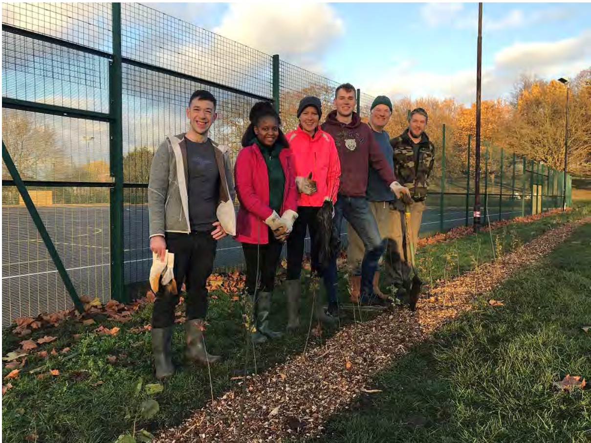
Plate 2. Corporate volunteers planting a native wildlife hedge in Norwood Park, as part of the Heritage Lottery Funded 'Great North Woods' project in winter 2018

The Lambeth BAP will encourage all those living and working in Lambeth with a responsibility for, or an interest in, the protection of wildlife and biodiversity to work together to continue doing, or improving on, what's working well, and avoid taking action or making decisions that might harm or impact upon Lambeth's wildlife status or biodiversity value.