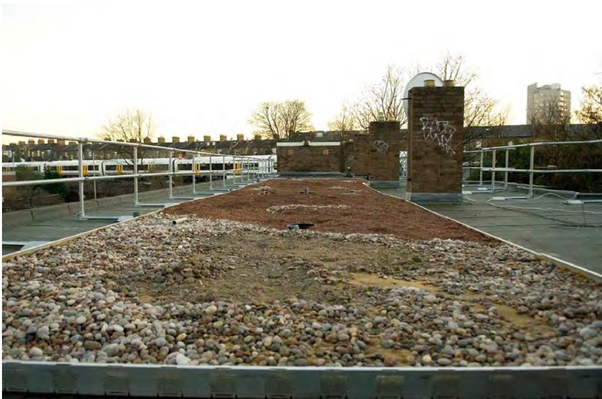
Plate 60. A new biodiverse living roof being constructed on the Fenwick Estate in Stockwell; the close proximity of a network of railway lines, as seen in the distance, was a key reason for its installation in order to extend and improve wildlife habitat

The Railway Linesides Habitat Action Plan for Lambeth will support building strong and sustainable neighbourhoods.