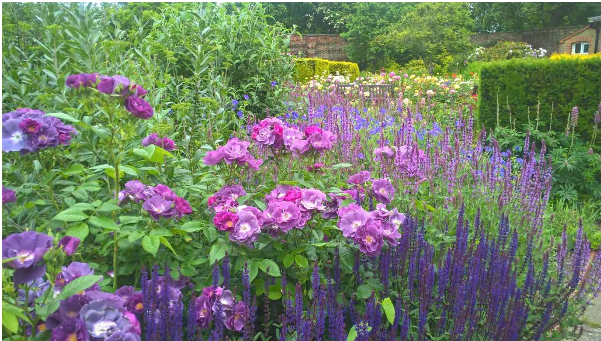
Plate 3. The Walled Garden in Brockwell Park, where providing horticultural excellence and promoting biodiversity go hand in hand

Just a day spent walking around Lambeth will show even the casual visitor just how lucky we are in terms of wild plants, animals and many different types of wildlife habitat, some common and widespread, others rare or even endangered in London or the UK as a whole. A walk in Brockwell Park, Clapham Common, Norwood Park or Ruskin Park will provide ample evidence of how much wildlife we have in the borough.