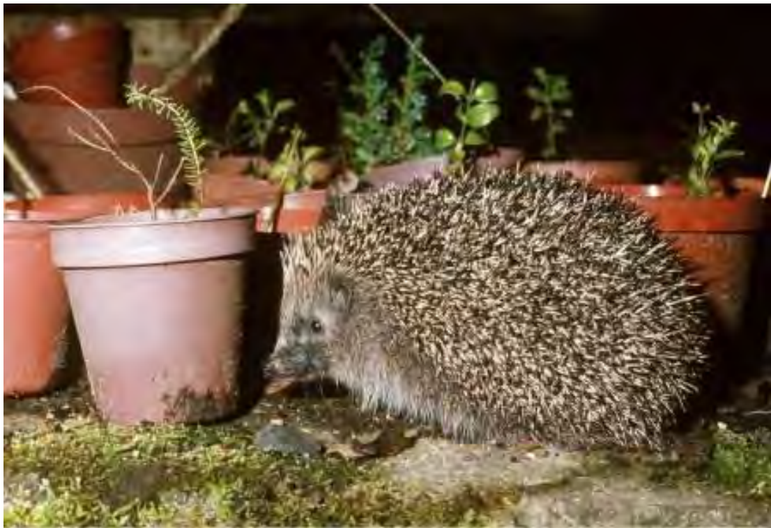
Plate 47. A European Hedgehog ( Erinaceus europaeus ), photographed in West Norwood – a once common species of gardens which is now in serious UK decline

Pesticide Use. This is a major cause of the decline of certain species, especially many garden birds and hedgehogs. Pesticides may also have more direct effects, for example insecticides will kill insects beneficial to gardens as well as target species whose destruction is desired by certain gardeners or landscapers. Although organic gardening is very popular in Lambeth, along with more environmentally friendly pest control methods, the desire for a 'quick fix' solution tends to limit choices of pest control methods for most gardeners, especially if they are time short and have busy lives or want an aesthetic effect over a more natural one.