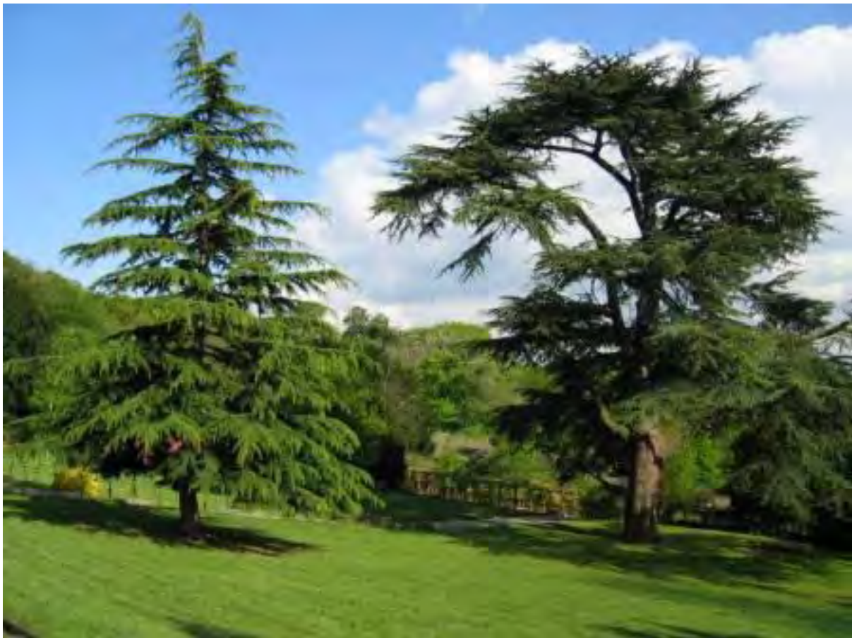
Plate 91. Mature evergreen trees within the Rookery at Streatham; all of the trees within this unique heritage and nature conservation site are fully protected from loss

All of Lambeth's trees and woodland sites are protected through various policies in the current Lambeth Local Plan which recognises their biodiversity, heritage and environmental value, and as requiring protection from inappropriate land management or development. Of particular relevance are Policies EN1 (Open space and biodiversity); Q6 (Public realm); Q9 (Landscaping); Q10 (Trees) and Q14 (Developments in gardens and on backland sites).