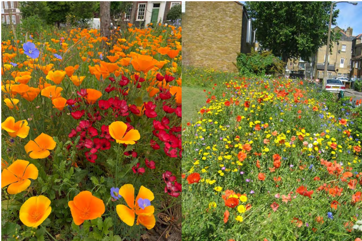
Plate 1. Summer displays of wildflowers on Clapham Common and Lambeth Walk Doorstep Green, respectively, add colour and biodiversity to our borough and lives

Lambeth is home to many wildlife habitats and species which are relatively common and abundant in London or even the UK, and which add variety and colour to the lives of people living in, working in or visiting the borough. Though not under any immediate threat, these habitats and species still need looking after and managed so they don’t get out of control or we end up putting their future wellbeing at risk by inappropriate management or neglect.