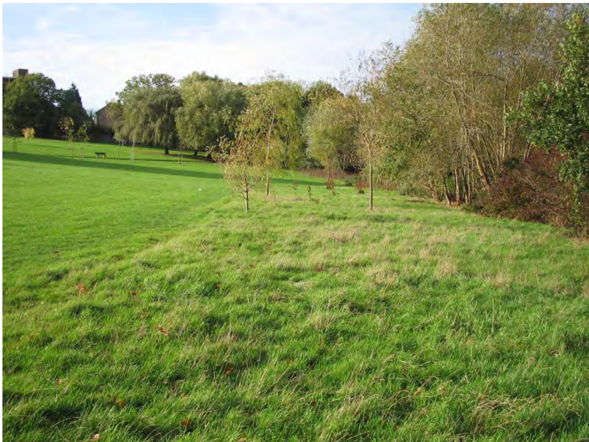
Plate 33. An area of meadow grassland in Norwood Park, developed on wet ground which helps mitigate for surface water flooding, not just within the park but also to protect an adjacent network of heavily used railway lines

The number of areas in Lambeth's parks and open spaces that are being managed as wet meadow grassland is also steadily increasing, especially in places where the groundwater table is high or they are prone to flooding and waterlogging. These wet grasslands are also important in helping manage and mitigate for surface water flooding in both the open space and surrounding roads or properties, slowing down the movement of water into higher risk areas and allowing it to dissipate before it causes material and financial damage elsewhere.