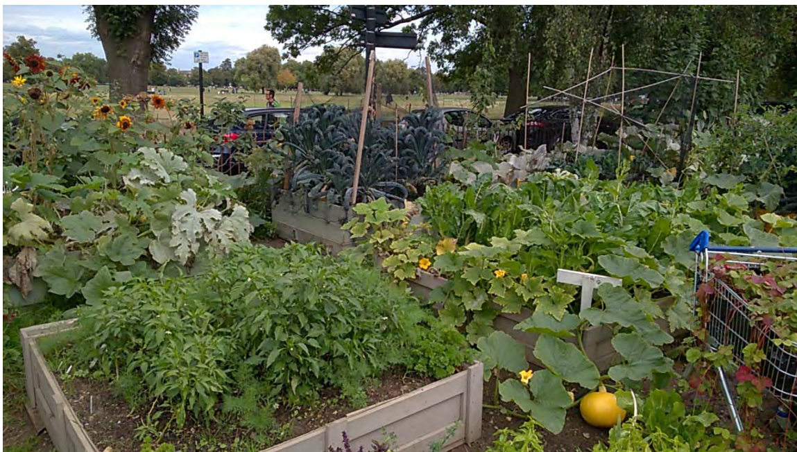
Plate 48. Growing beds inside the 'Clapham Common Bandstand Beds', adding more colour and biodiversity to the Common, as well as a safe place to grow healthy food

Inappropriate or Poor Gardening Methods. Where people manage to get an allotment plot or community growing area, they might be inexperienced and have a lack of success with traditional more ecologically friendly methods. They can be tempted to manage the site or their plot in an aggressive 'all out' manner, so they don't provide space for wildlife or are tempted to use chemicals to fertilise the ground or control pests to maximum return.