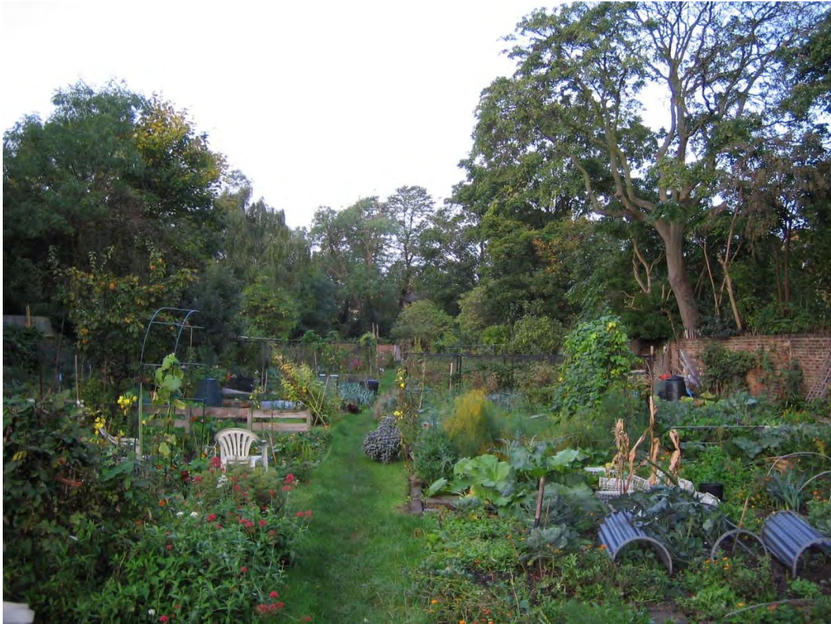
Plate 46. View of Lorn Road Allotments, a small council-owned allotment site with a plotholder community actively committed to organic, biodiversity-friendly gardening

There are well over 20 identified allotment and community garden sites in Lambeth comprising a total area of around 18 hectares, which amounts to about 0.7% of the total land area of the borough. There are 15 known allotment sites, some private and some council owned, covering a total of 15 hectares.