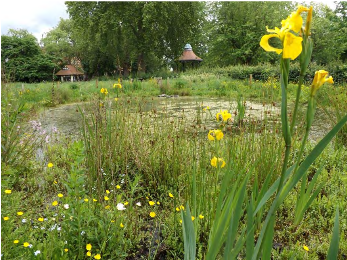
Plate 4. View of the pond in the Nature Conservation Area in Myatt's Fields Park

Lambeth is rich in wildlife. It's not just rich in wildlife habitat - the places wildlife likes to live such as parks, gardens, allotments and railway linesides, it's also rich in a surprising diversity of wild plants and animals that use these habitats for shelter, feeding, breeding or travel.