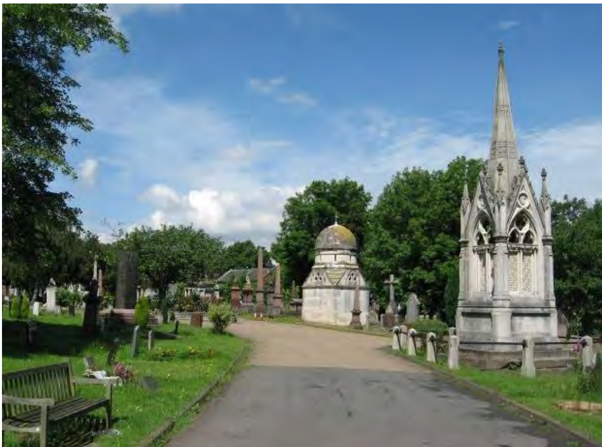
Plate 24. View into West Norwood Cemetery, one of Lambeth's three cemeteries – all three are designated as Borough Grade Sites of Importance for Nature Conservation in recognition of their importance for biodiversity and people's access to nature

Lambeth is also lucky to contain, or have responsibility for, a number of cemeteries and churchyards which are located in the borough. Churchyards are burial grounds associated with an identifiable church building: some churches also have extensions and detached burial grounds to provide additional space. They are scattered across the borough, often located at the centre of a historical 'settlement' which once had its own parish church. Once a churchyard is full in terms of burials, it becomes a 'closed churchyard'. On becoming closed the maintenance (but not always actual ownership) of many church burial grounds has devolved to Lambeth Council.