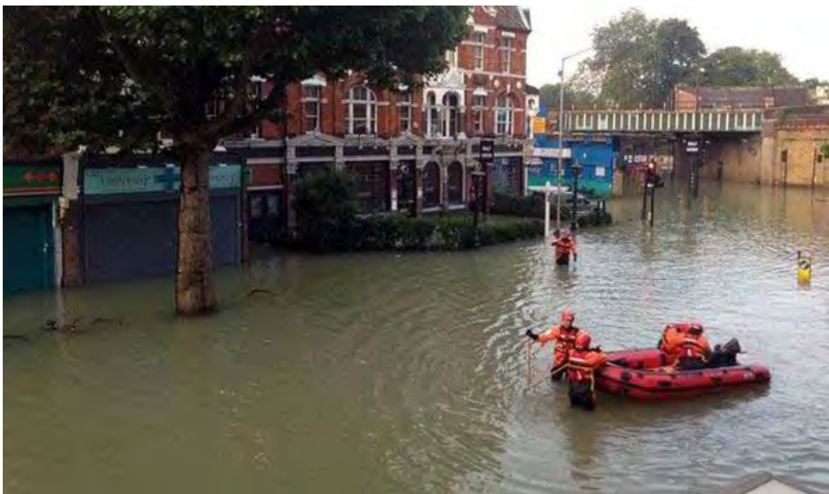
Plate 62. The consequences of flash flooding in Lambeth, Herne Hill Junction 2004; ponds, streams and other water features in nearby Brockwell Park are increasingly designed and managed to help prevent or reduce future incidents like this

They also play a vital role in Lambeth's resilience strategy for dealing with flooding caused by excessive or uncontrolled flows of ground and surface waters, which is a major issue in many parts of the borough. They are often integrated into various sustainable urban drainage systems (SuDS) across the borough, or new shallow ponds and scrapes can help temporarily store flash flooding or excessive rainfall until it can be gradually dispersed or drained safely away from high risk areas like roads, housing or business estates.