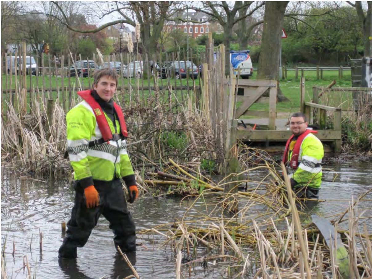
Plate 70. Staff from the Environment Agency assisting with scrub and reed removal on Mount Pond, Clapham Common, to improve habitat quality and diversity