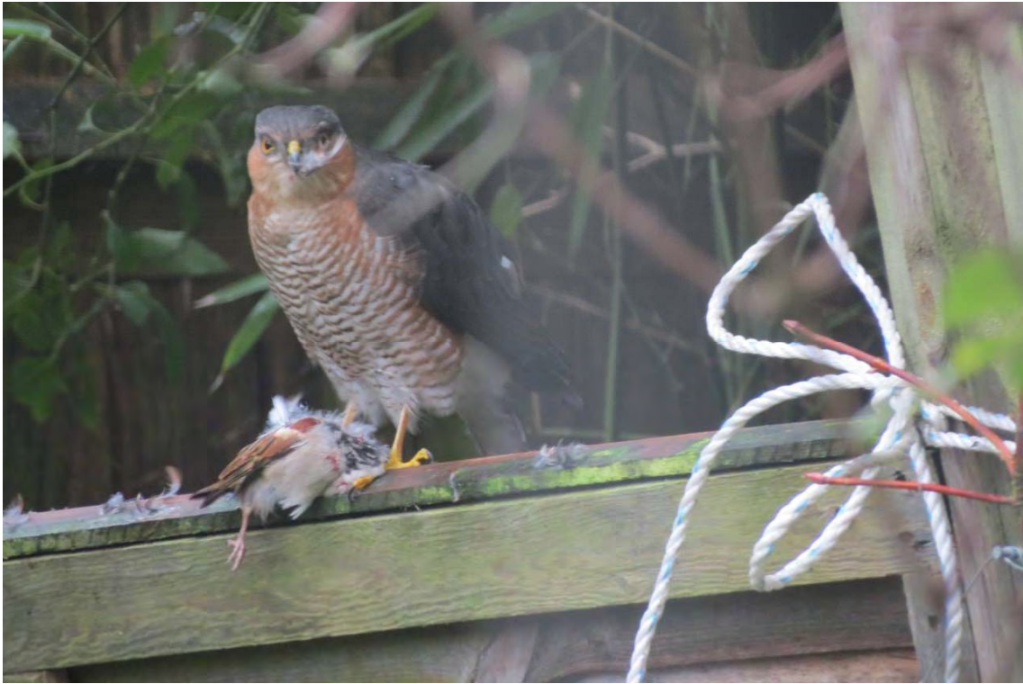
Plate 57. A sparrowhawk, with its prey, feeding on a fence alongside railway linesides between Herne Hill and Tulse Hill stations – a common sight along railway land

Unfortunately, extending existing or creating new railway stations/platforms or increasing the number of railway lines can, if not carefully planned, impact negatively on existing wildlife habitat on each side of the railway lines or around stations. Railway lineside wildlife is fairly tolerant of humans and human activity, so it can be accommodated or recover, but there might need to be replacement or compensatory land provided, especially if open grassland/scrub or good quality tree cover is being removed as a consequence of the development.