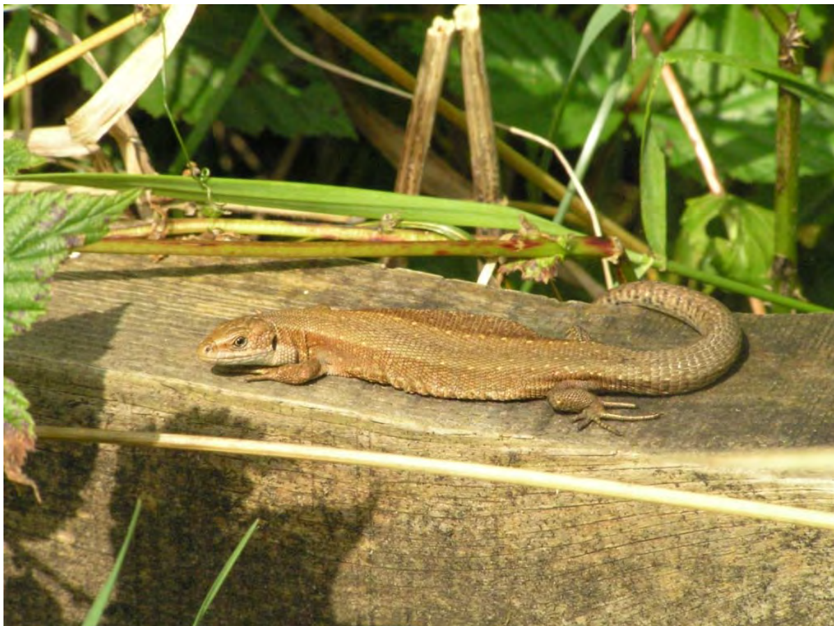
Plate 59. A male common lizard in a garden beside railway linesides in Streatham Vale

There are a number of species of plant and animal which are intimately associated with the habitat types found on or alongside railway linesides throughout Lambeth, and where protection, improvement and creation/extension of this habitat mosaic is critical to ensure their continued presence in the borough. These 'priority species' will benefit significantly from increasing awareness of the biodiversity importance of railway land in the borough, concurrent with the delivery of various actions which are described later in the plan.