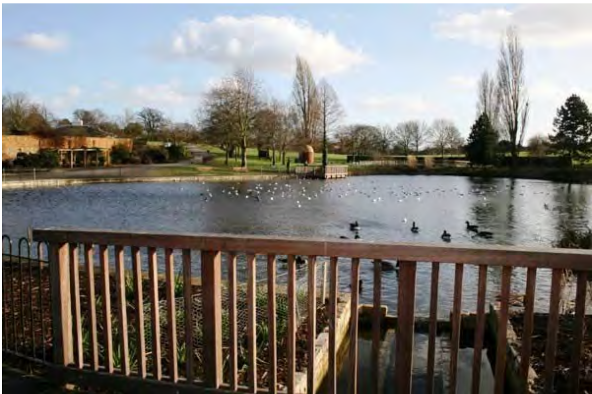
Plate 66. View across the main pond at Brockwell Park, following extensive restoration and landscaping, including new biodiversity features, in 2012

None of the rivers and ponds in Lambeth have specific designations to confer protection solely for their nature conservation status. However, a number of ponds and parts of the catchments of the Rivers Effra and Graveney are within existing Sites of Importance for Nature Conservation (SINCs) for Lambeth, and provided with protection from inappropriate use or loss in the Lambeth Local Plan under Policy EN1 (Open space and biodiversity).