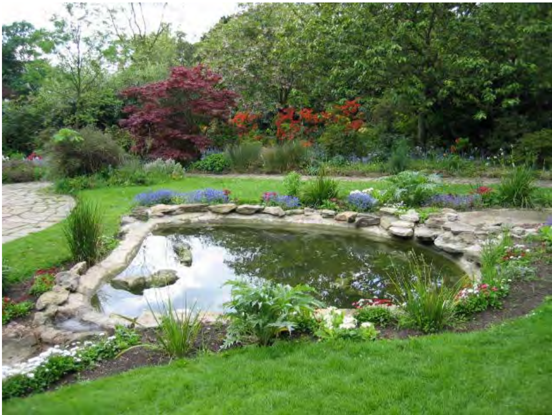
Plate 63. Part of the 'cascade' in the Rookery at Streatham; this ornamental feature may have been created out of one of the smaller spring-fed tributaries of the River Graveney

Lambeth also contains part of the River Graveney, one of the main tributaries of the River Wandle. The Graveney's catchment includes a large area of Streatham and Knight's Hill, and minor tributaries are found running through Streatham Common and the Rookery. These minor tributaries are open to the air but only running with water following heavy and persistent rainfall which either recharges the aquifers that feeds the springs at source, or through percolation of surface and groundwater into the stream's local catchment.