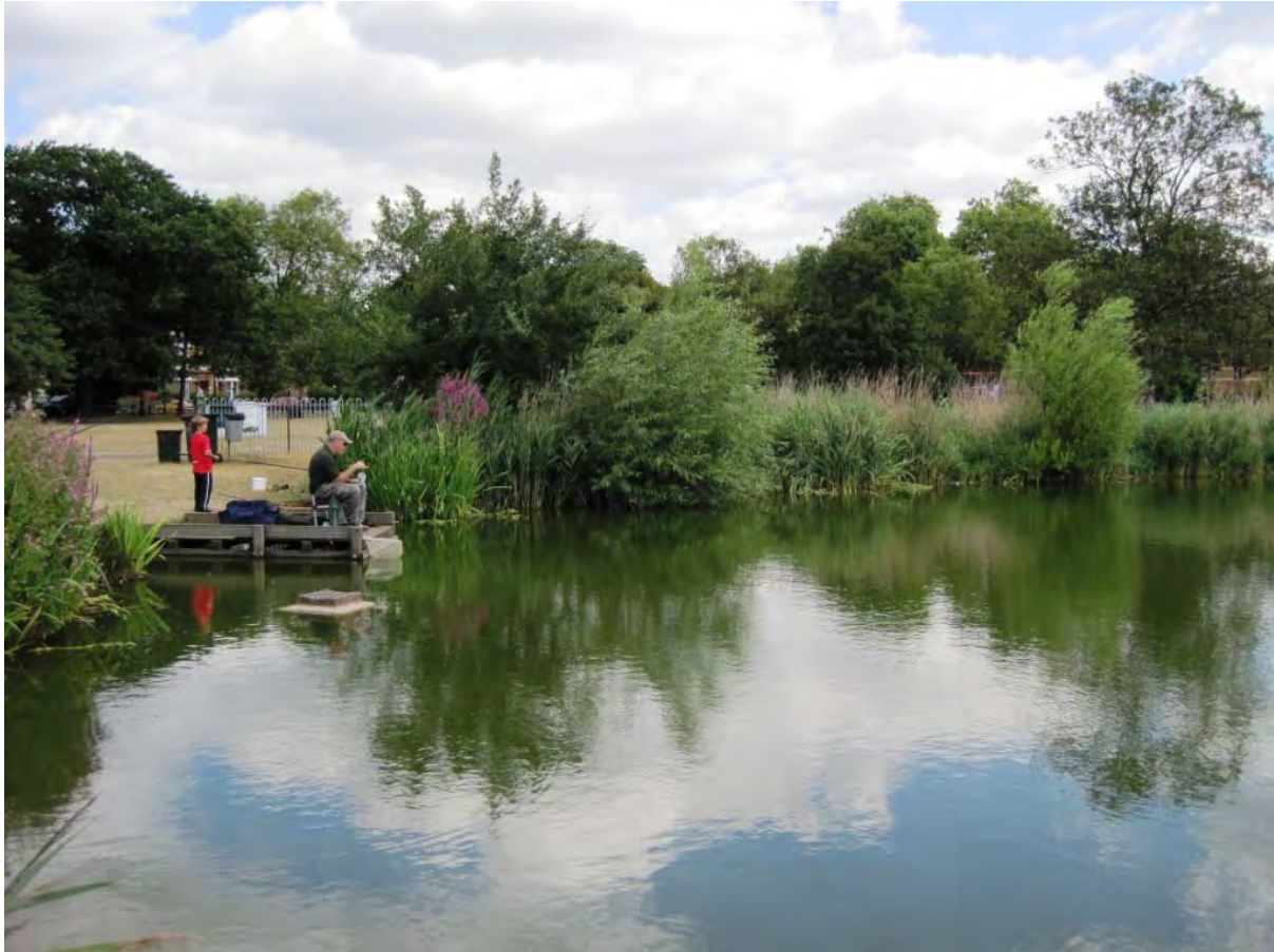
Plate 65. Fishing on Eagle Pond, Clapham Common; the needs of recreational sports and nature conservation can sometimes be in conflict, unless properly managed

Conflicts over Use and Access. Conflicts can occur in water bodies where there is demand for recreational and leisure uses like fishing, boating, swimming, picnicking, music, events and dog walking. Pressure on river/pond banks, and the water itself, could 'squeeze out' or confine areas of wildlife importance to limited locations, or noise and disturbance can drive out or deter wildlife, especially more sensitive species or when they are nesting or hibernating.