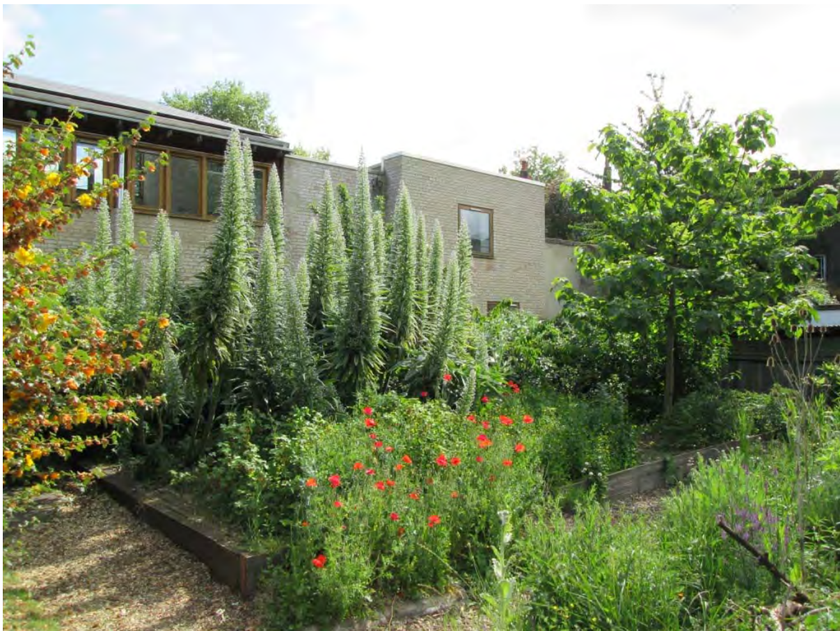
Plate 14. Part of the gardens of 'Roots and Shoots' in Vauxhall, one of Lambeth's current and longest-serving Borough Sites of Importance for Nature Conservation

The number, area and designation of Lambeth's SINC is currently being reviewed as part of the revision of the Lambeth Local Plan to take into account any changes in content and quality. The Local Plan revision isn't due to be completed until mid-2019, which may change the total number of SINC for the borough, as well as individual areas and classification. This may impact upon the borough's existing AoDs for access to nature, hopefully in a positive way. The Lambeth BAP will then help identify resources and activities to improve the management and use of new SINC, and how resulting AoDs are reduced through appropriate interventions.