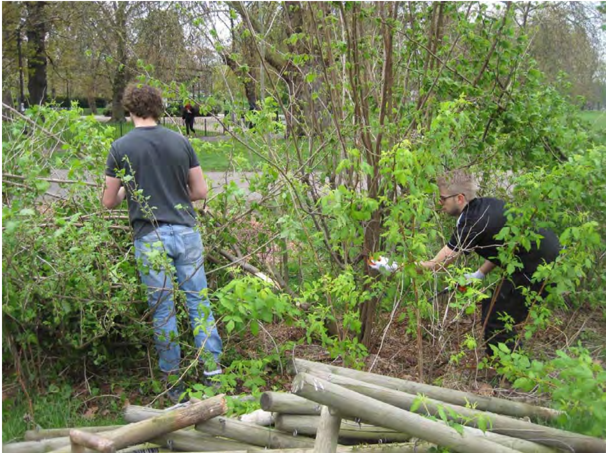
Plate 28. Corporate volunteers helping to lay a native hedge in Ruskin Park, Camberwell, in order to create and extend an important 'wildlife corridor'

We will work with our stakeholders and partners to secure appropriate mitigation and/or compensation where existing wildlife habitat within the borough's parks and other open spaces is at risk of being compromised, reduced or lost as a result of poor management or unavoidable development. We will also work to secure opportunities to not only create new public open spaces, especially in areas of deficiency to accessible open space in the borough, but also provide features that will provide new or extended wildlife habitat which will also help improve the public's access to nature in these locations.