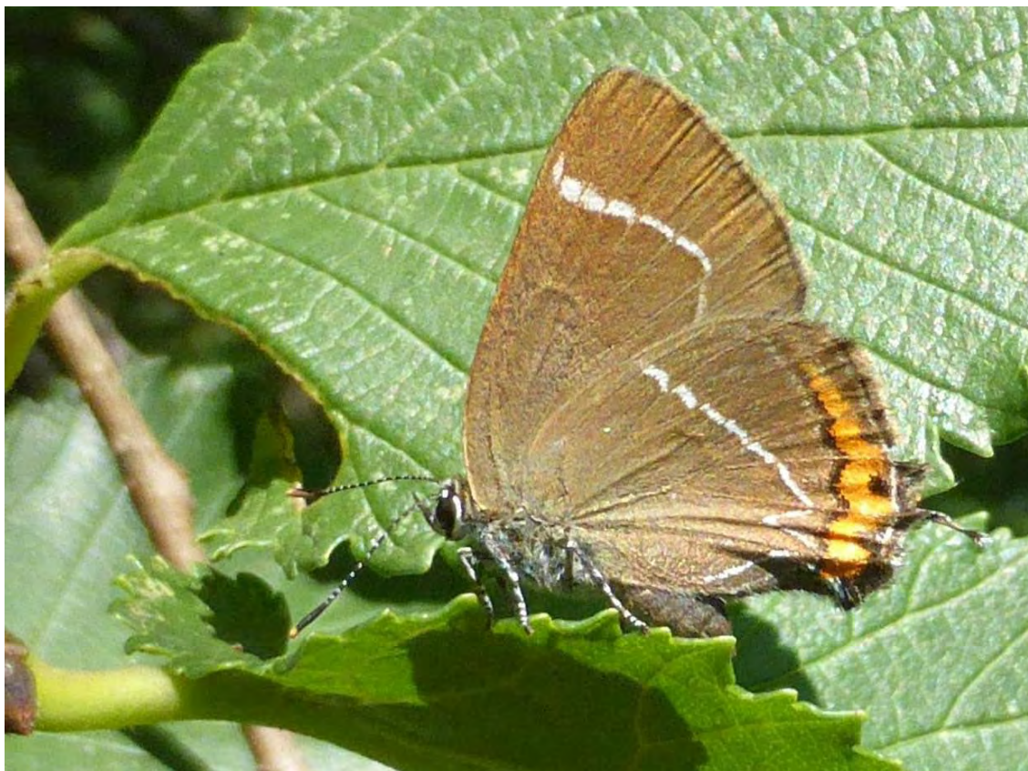
Plate 93. A White-letter Hairstreak butterfly ( Satyrrium w-album ) butterfly resting on elm leaves, its larval food plant

For example, a colony of White-letter Hairstreak butterflies ( Satyrrium w-album ) was recorded by surveyors from Butterfly Conservation on a number of elm trees next to a multi-use games court (MUGA) on Vauxhall Pleasure Gardens in July 2017.