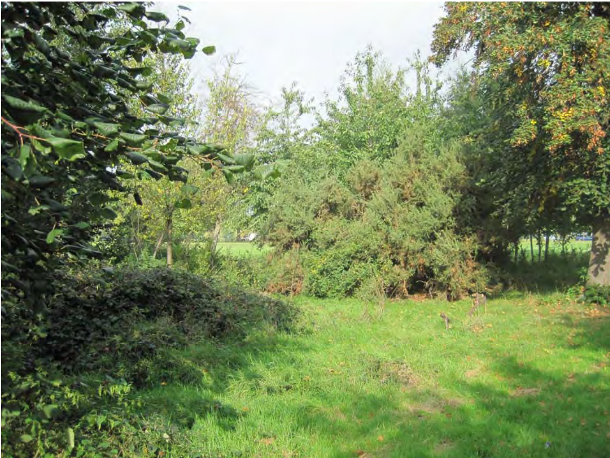
Plate 88. Scrub and young tree sapling encroachment into woodland pasture on Clapham Common – reducing open ground cover and reducing ecological quality

Poor or Inappropriate Management. Trees and woodlands can suffer, or have suffered, for various reasons from poor or inappropriate arboricultural and habitat management. Although trees and woodlands are included in a number of tree or grounds maintenance specifications and contracts in the borough, traditionally these were not specifically designed to maintain or improve tree or woodland biodiversity. Tree maintenance can be primarily focused on public, vehicle and building safety and reducing the financial exposure of the landowner, rather than on the needs of wildlife or protecting the ecological value of the tree or the woods.