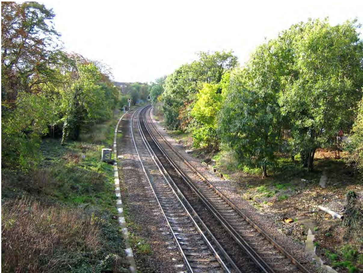
Plate 56. View of railway lineside habitat near Streatham station, part of a large Borough Site of Importance for Nature Conservation

If a 15 metre swathe is regularly clear felled adjacent to the railway lines, as has happened in the past, this will be inadequate in maintaining existing grasslands, nor will it help in restoring grassland which has since evolved into scrub and woodland. Clear felling of trees without considering the ecological impacts is unacceptable, whereas careful selective pruning, removal or thinning out of dense tree cover will have positive biodiversity benefits.