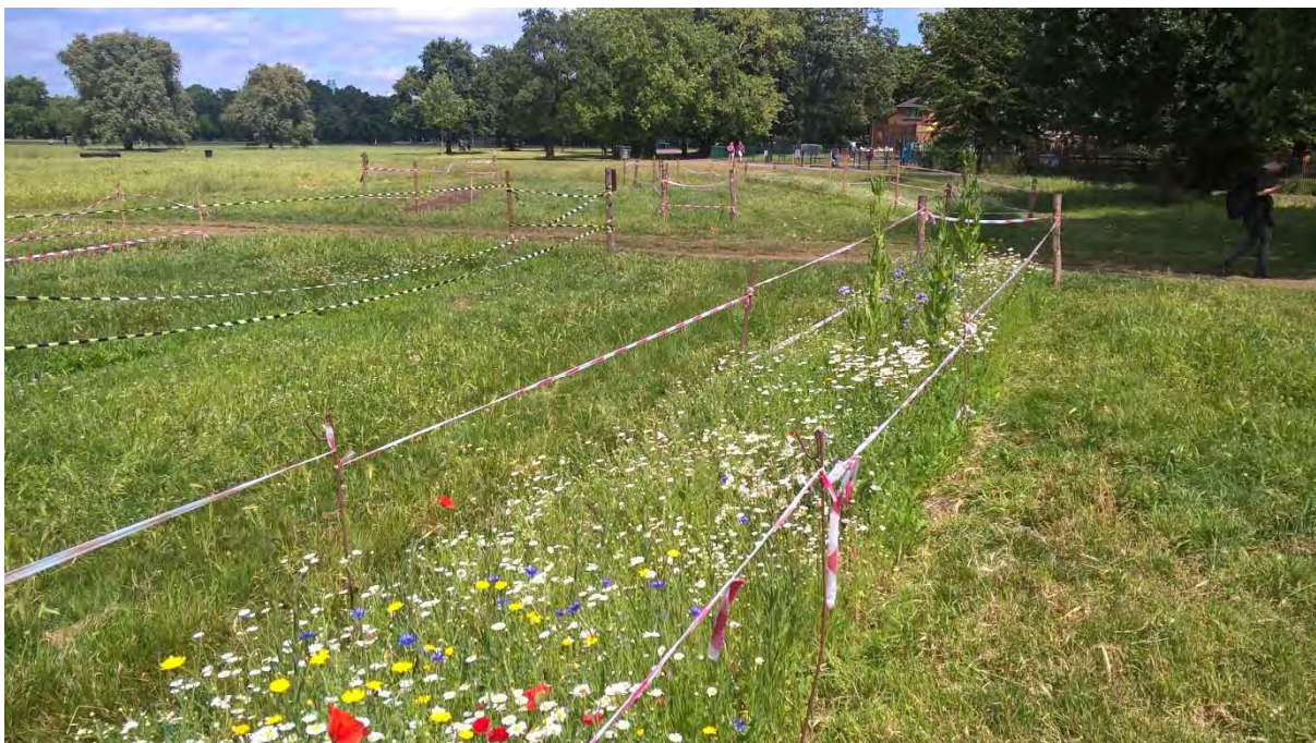
Plate 39. ‘Colour Your Common’ in 2018 – creating strips of species-rich wildflower meadow on Clapham Common to boost its importance for pollinators and people