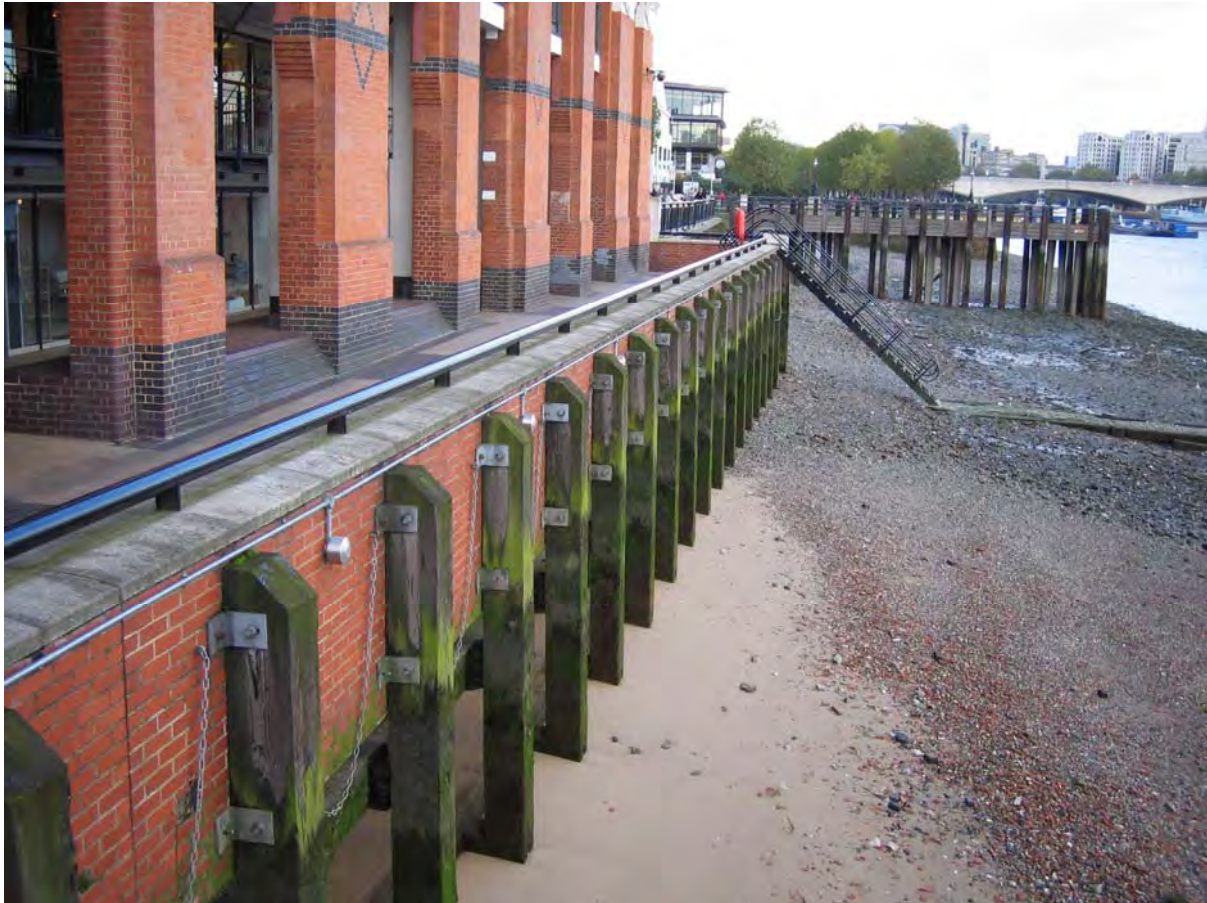
Plate 75. The River Thames at low tide outside of the Oxo Tower building in Waterloo, showing the tight juxtaposition of buildings and footways to walls and foreshore

Development-led Encroachment. The Tidal Thames has a long history of suffering from human activities, especially development-led encroachment, which since Roman times has reduced the net area of estuarine habitat within London. Despite stronger planning legislation and constraints imposed by flood defences and protected jetties and walls, foreshore habitat loss is still at risk from various riverside redevelopments.