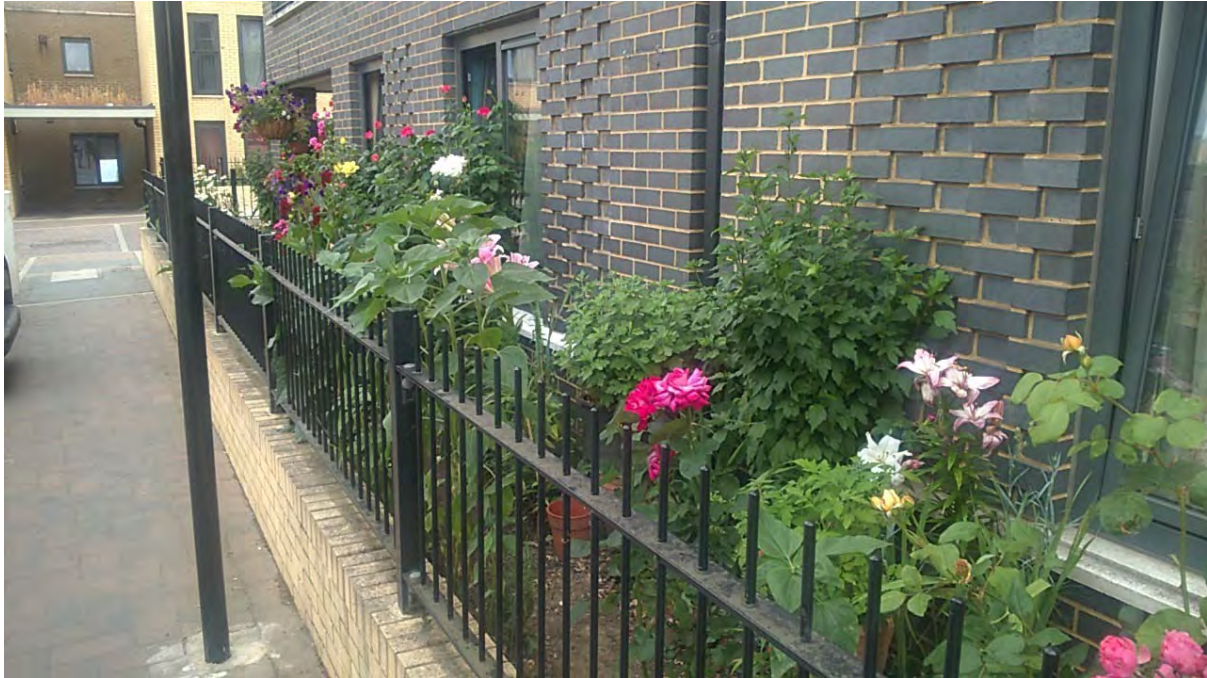
Plate 43. Myatt's Fields Estate North, Brixton – local residents making the most of small front garden spaces to grow plants and flowers that also have an ecological benefit

These private greenspaces form an important part of Lambeth's rich heritage, culture and landscape, and often provide places for residents or occupants of the buildings to enjoy frequent contact with nature where they and their families live or work. They are often some of the most varied areas of greenspace in Lambeth, and range in size from tiny 'pocket handkerchief' backyards to elaborate landscaped vistas.