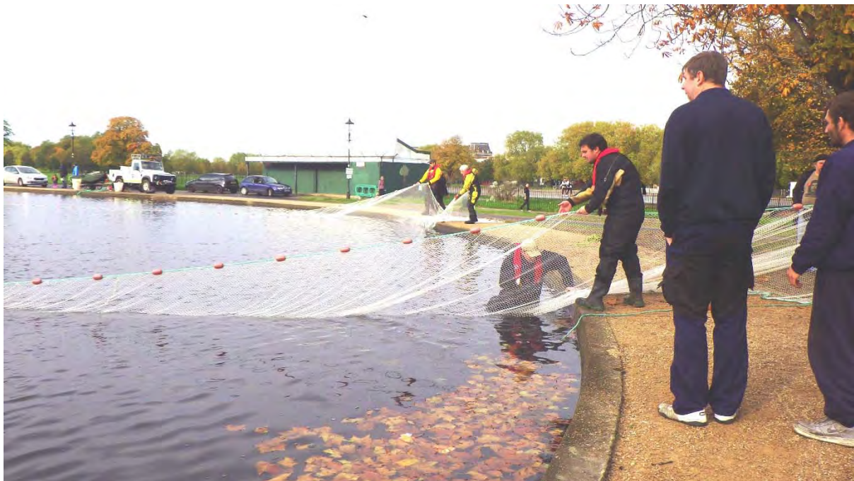
Plate 69. Fish netting and collection exercise on Long Pond at Clapham Common, undertaken with the Environment Agency to help improve fish stocks and biodiversity