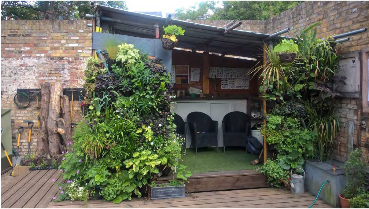
Plate 50. Communal area inside Lorn Road Allotments, along with a small and charming example of a wildlife-friendly 'living wall'!