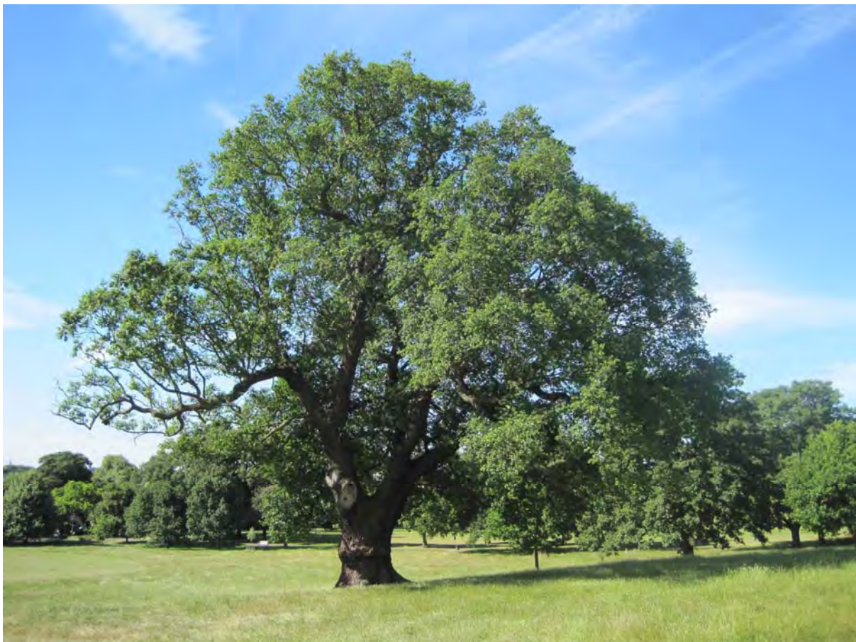
Plate 82. A veteran English Oak in Brockwell Park, probably over 500 years old, and still providing an enormous diversity of environmental benefits to both the park and the wider community

Trees and plants with abundant and wide leaves also provide a greater area to intercept rainfall, and slow down the speed at which it hits the ground, allowing more time for the water to soak into soils or be taken up by tree roots. Woodlands and mature hedges are especially important in flood mitigation and SuDS systems, due not only to the large number of trees within them but also their huge root coverage and the often loose porous soils, which help trap and slow down the movement of water and then quickly absorb it into the trees.