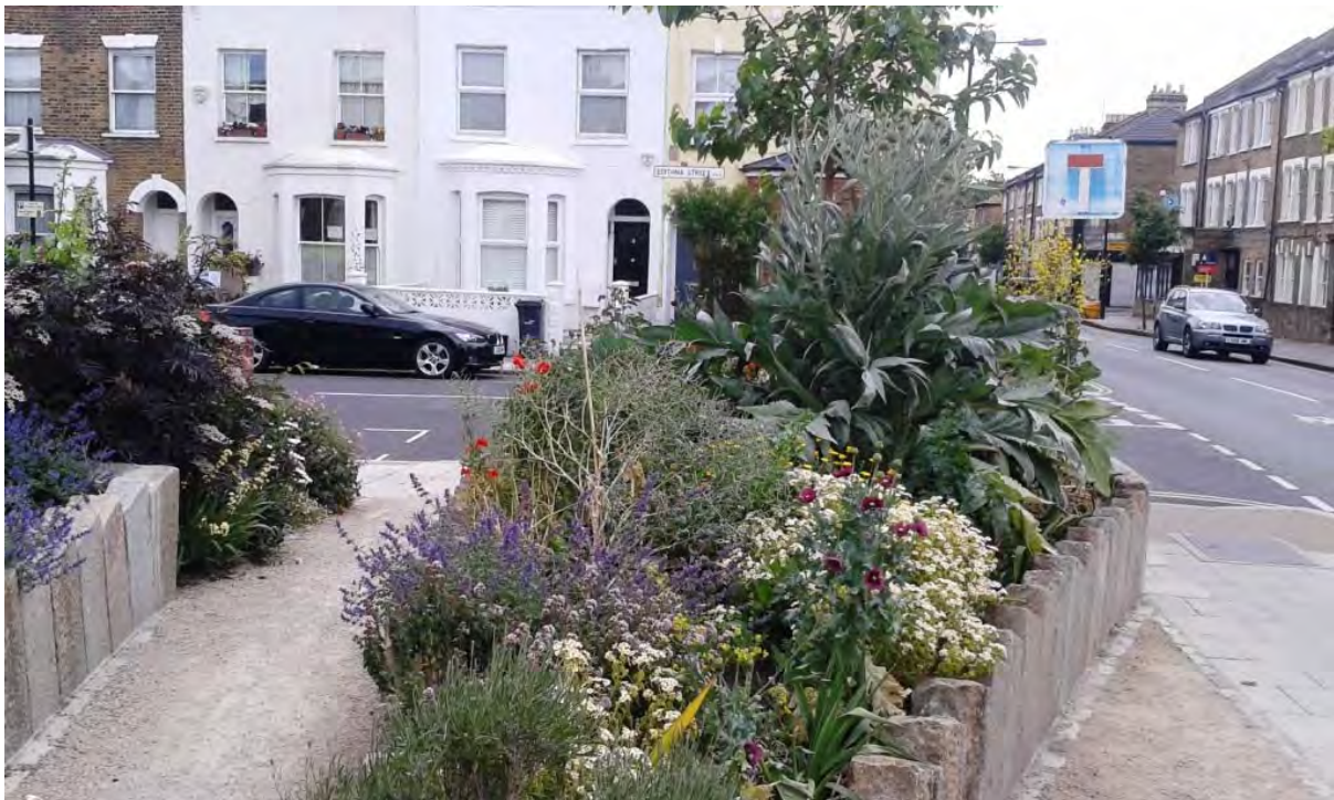
Plate 16. The 'Edible Bus Stop' in Stockwell, an important wildlife-friendly food growing project included in the Private Gardens and Growing Spaces Action Plan

It must be noted that these priority HAPs do not include excessively long lists of detailed actions to be undertaken to achieve the objectives and targets of that HAP; each has a simple set of actions that are easy to understand and respond to. This is because actions in the Lambeth BAP need to be realistic.