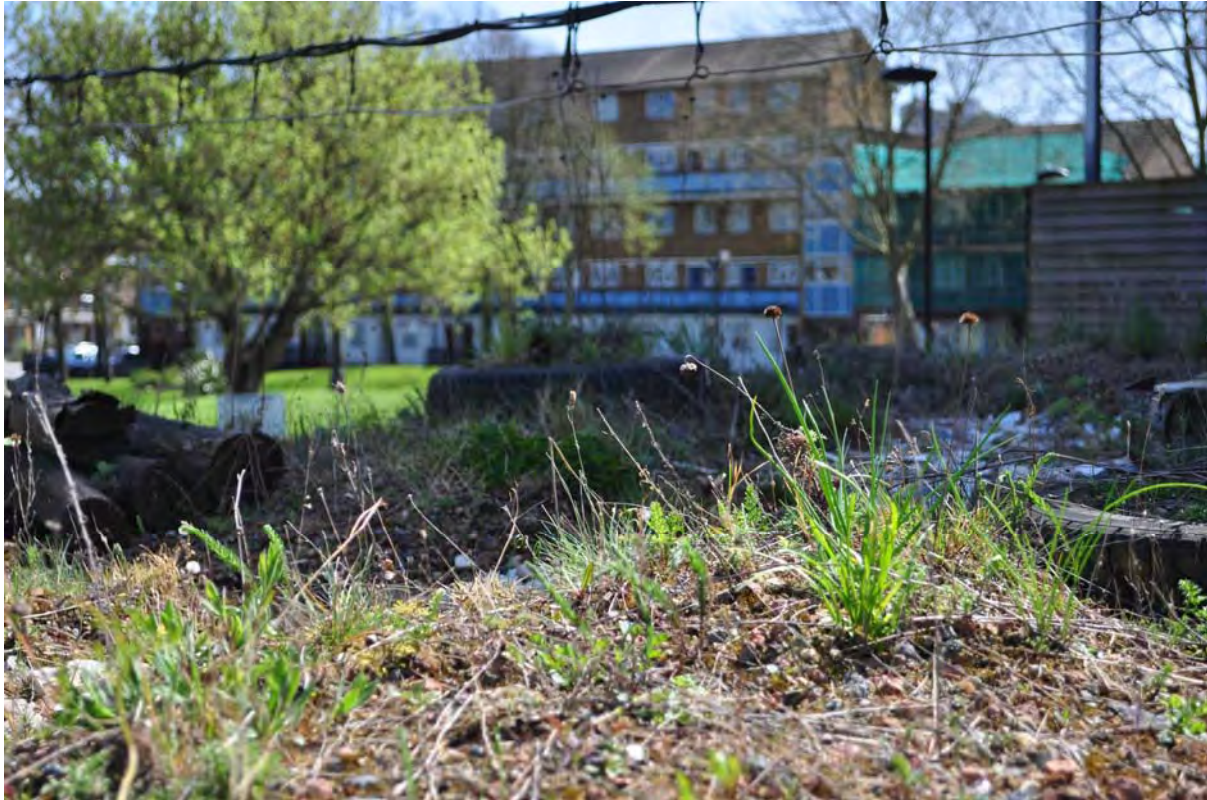
Plate 19. Plant growth on an old wall in North Lambeth, showing the diversity of species which can be found on built structures

This complex green infrastructure provides a range of habitat types that offer wild plants somewhere to grow and establish, in locations where they escape disturbance or removal as a result of 'manicuring' or 'tidying up' spaces to make them look neat and presentable. These habitats, and the plants that grow in them, provide homes for different animals including birds, bats and invertebrates, who use them for shelter, roosting or foraging.