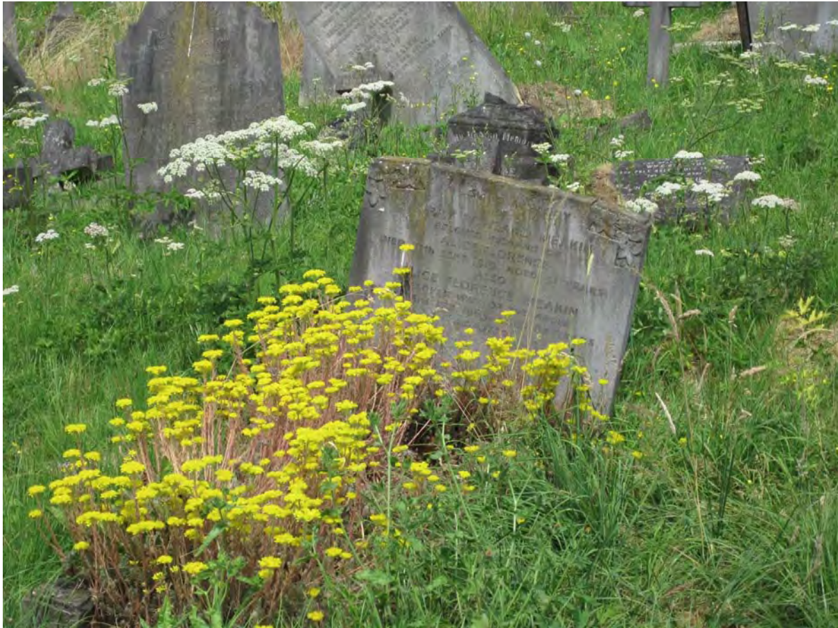
Plate 26. Sedum and other drought-tolerant native plants growing on and around an old grave in West Norwood Cemetery

The gravestones, monuments and walls which abound in and around Lambeth's cemeteries and churchyards often provide unusual 'horizontal' or 'vertical' habitats based on the diversity of rock types used to make them and the surfaces they are finished in, such as limestone, sandstone, granite, basalt and even concrete. These materials, as they weather and age, create a wide range of 'microhabitats' and thin soils which favour different species of fern, moss, lichen and herb; these in turn provide food and shelter for a wide range of invertebrates, as well as birds which feed on them and the plants themselves.