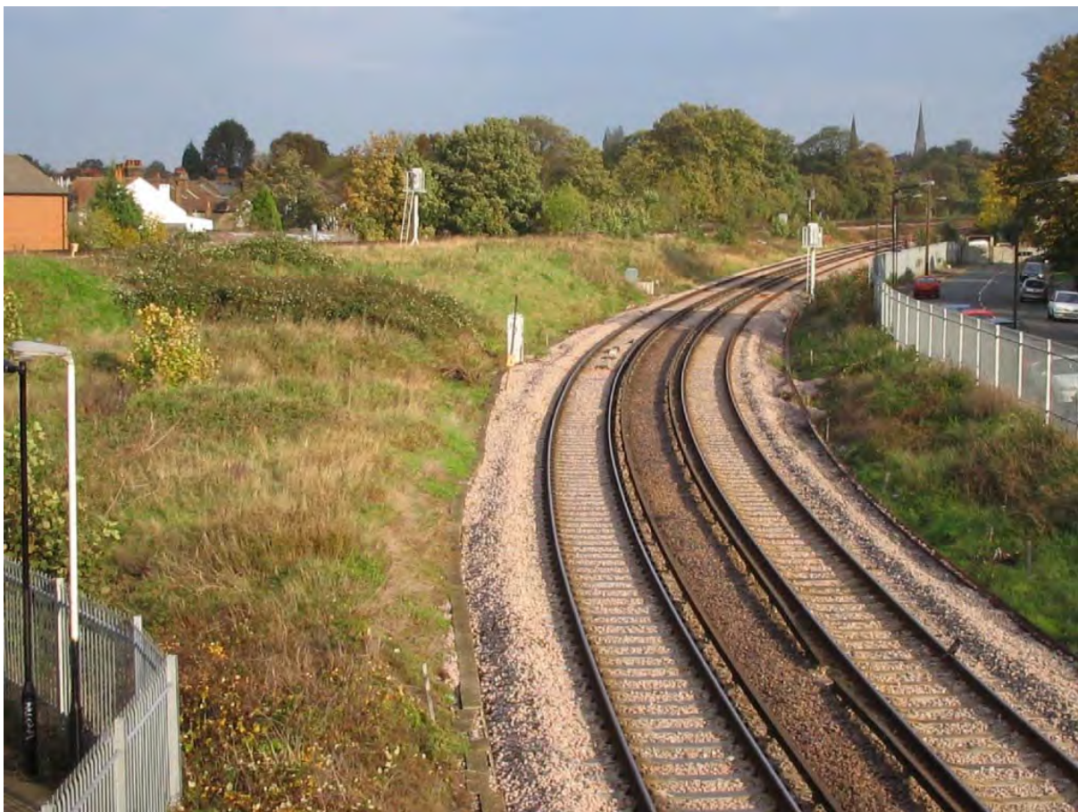
Plate 53. View of railway lineside habitat near Streatham Common station, part of a large Borough Site of Importance for Nature Conservation

There are about 24 kilometres of 'railway corridor land' within the Borough of Lambeth, which makes up about 2.9% of London's total. About 40 hectares of Lambeth is classified as 'railway lineside', which constitutes around 1.47% of the total area of the borough.