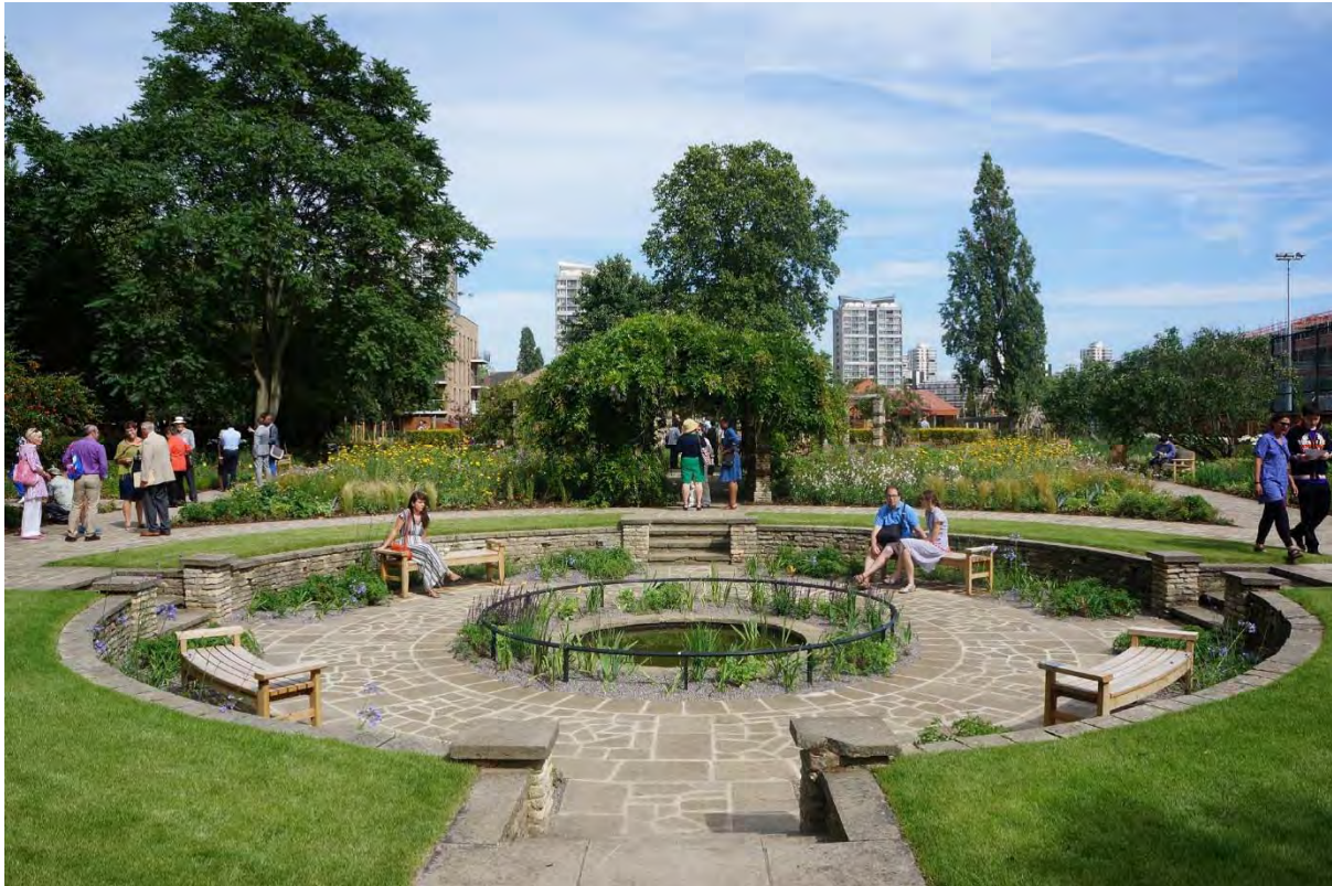
Plate 5. View of the Flower Garden in Kennington Park, recently restored to provide features of importance of nature conservation including the small pond

Lambeth has plenty of species and different habitats (some common, some rare) and a diverse mixture of ecosystems. This means that what applies to the Earth as a whole also applies to Lambeth, although on a much smaller scale.