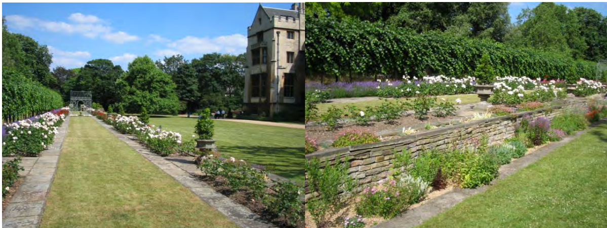
Plate 42. Two view of the gardens of Lambeth Palace, which is actively managed for biodiversity and is now a Borough Site of Importance for Nature Conservation

This includes the grounds of many public and private schools and children’s nurseries in Lambeth, the grounds of hospitals, doctor’s surgeries or clinics, and the grounds of museums or places of worship which are not in council ownership or managed for free public access. The grounds of notable historic buildings in Lambeth, such as the Garden Museum, Lambeth Palace Gardens or Tate Mews in Streatham, which were once the grounds of a convent but are now in private occupation, would also fall into this category.