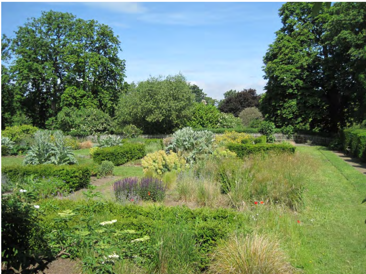
Plate 41. The Old Bowling Green Garden in Ruskin Park; converted from a neglected bowling green into a species-rich, pollinator-friendly resource

EN1 (Open space and biodiversity); EN2 (Local food growing and production); EN4 (Sustainable design and construction); EN5 (Flood risk); EN6 (Sustainable drainage systems and water management); Q6 (Public realm); Q9 (Landscaping); Q10 (Trees); Q21 (Registered parks and gardens)