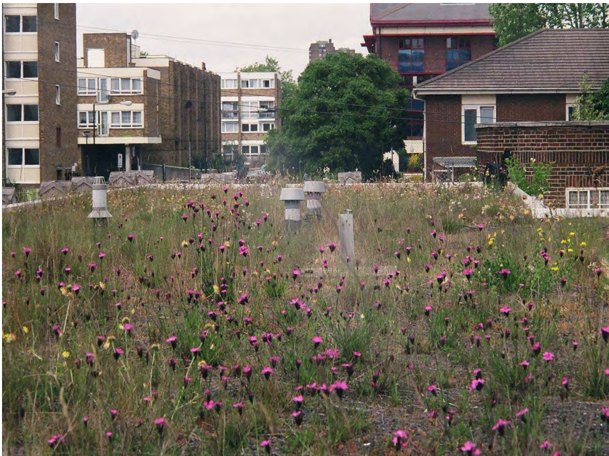
Plate 22. A biodiverse living roof on part of the Fenwick Estate in Clapham – ideal habitat for species like the Black Redstart, bats and numerous invertebrates

EN1 (Open space and biodiversity); EN2 (Local food growing and production); EN4 (Sustainable design and construction); EN5 (Flood risk); EN6 (Sustainable drainage systems and water management); Q6 (Public realm); Q9 (Landscaping); Q10 (Trees); Q14 (Developments in gardens and on backland sites).