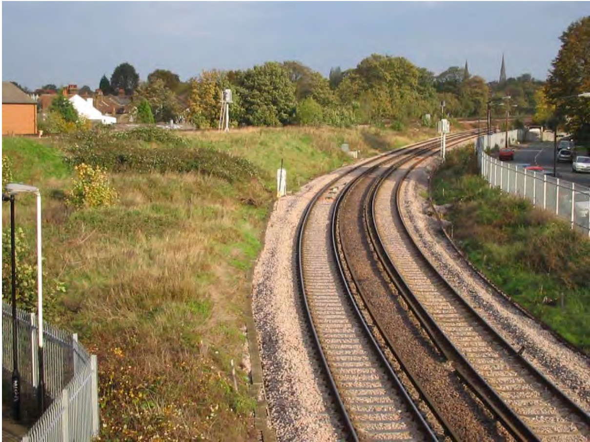
Plate 58. Well-managed railway land with a diversity of different habitat types, and good 'green corridor connections' surrounding wildlife habitat, including local gardens

This means that, as part of any changes of use, inappropriate development or inconsiderate management for Lambeth's railway land, any attempts to intentionally kill these protected species or disturb their nesting or breeding sites could render the rail operators and/or their contractors, or indeed any neighbouring property owners, liable to prosecution or the refusal of their development or management proposals.