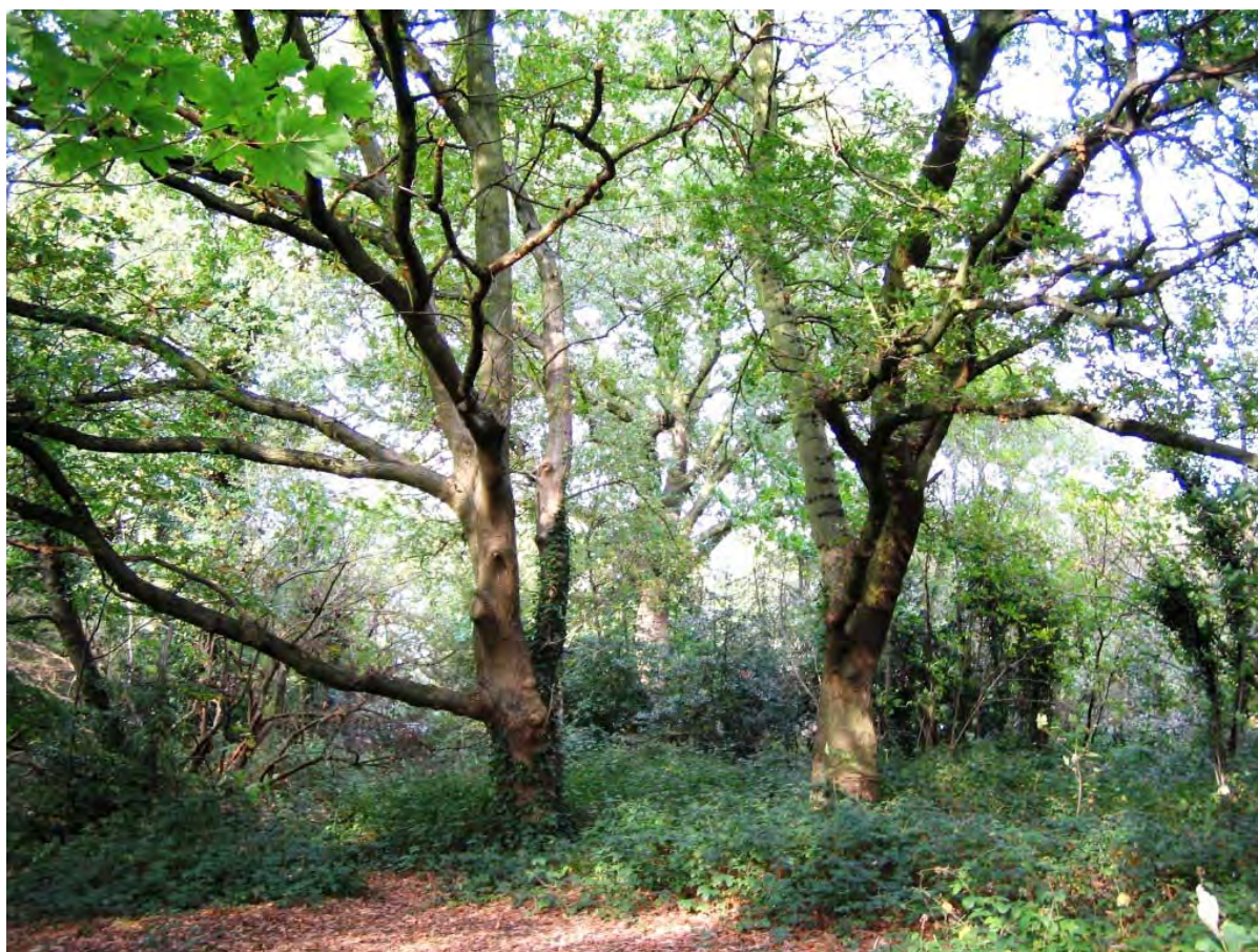
Plate 80. Mature deciduous woodland on Streatham Common

Trees, woodlands and mature hedges make up the 'urban forest' – a complex network of trees and the habitats they both make up and support. Lambeth's urban forest plays a crucial role in supporting and maintaining the ecological infrastructure of not just the borough but also of London and our neighbouring boroughs of Croydon, Lewisham, Southwark and Wandsworth.