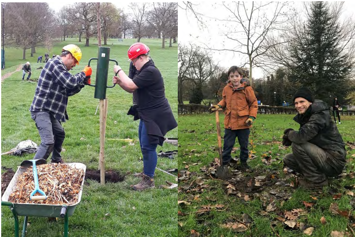
Plate 95. Corporate and community volunteers planting new native trees in Norwood park as part of the Heritage Lottery Funded ‘Great North Woods’ project