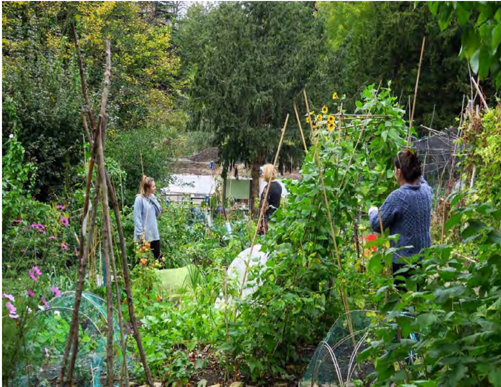
Plate 51. View of the Streatham Common Community Garden at Streatham Rookery