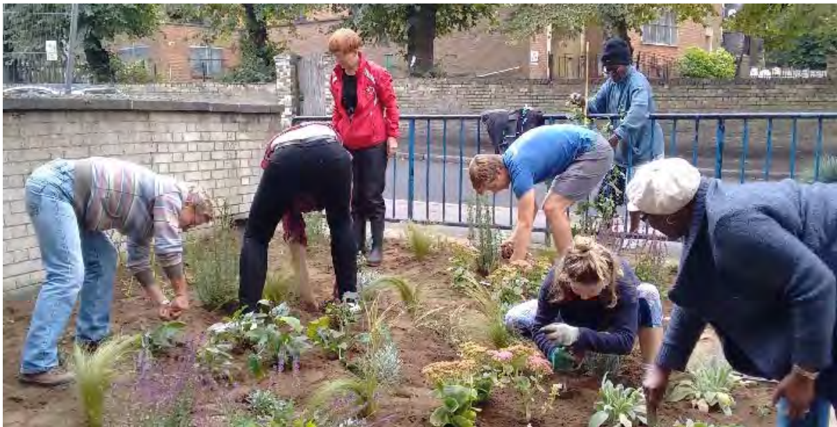
Plate 10. Planting out a new wildlife-friendly 'rain garden' on Calidore Close, Herne Hill, as part of the 'Lost Effra' flood awareness and mitigation project in 2017

Open spaces managed for natural value often have a greater potential to provide flood mitigation and make areas resilient to flood damage. Landscape or wildlife features like wildflower and grassland meadows, mixed age woodland, streams, ponds and lakes with natural banks and marginal vegetation, and mounded swales or sunken scrapes, help arrest, divert and store water that could result in waterlogging, flash flooding or wall/bank erosion.