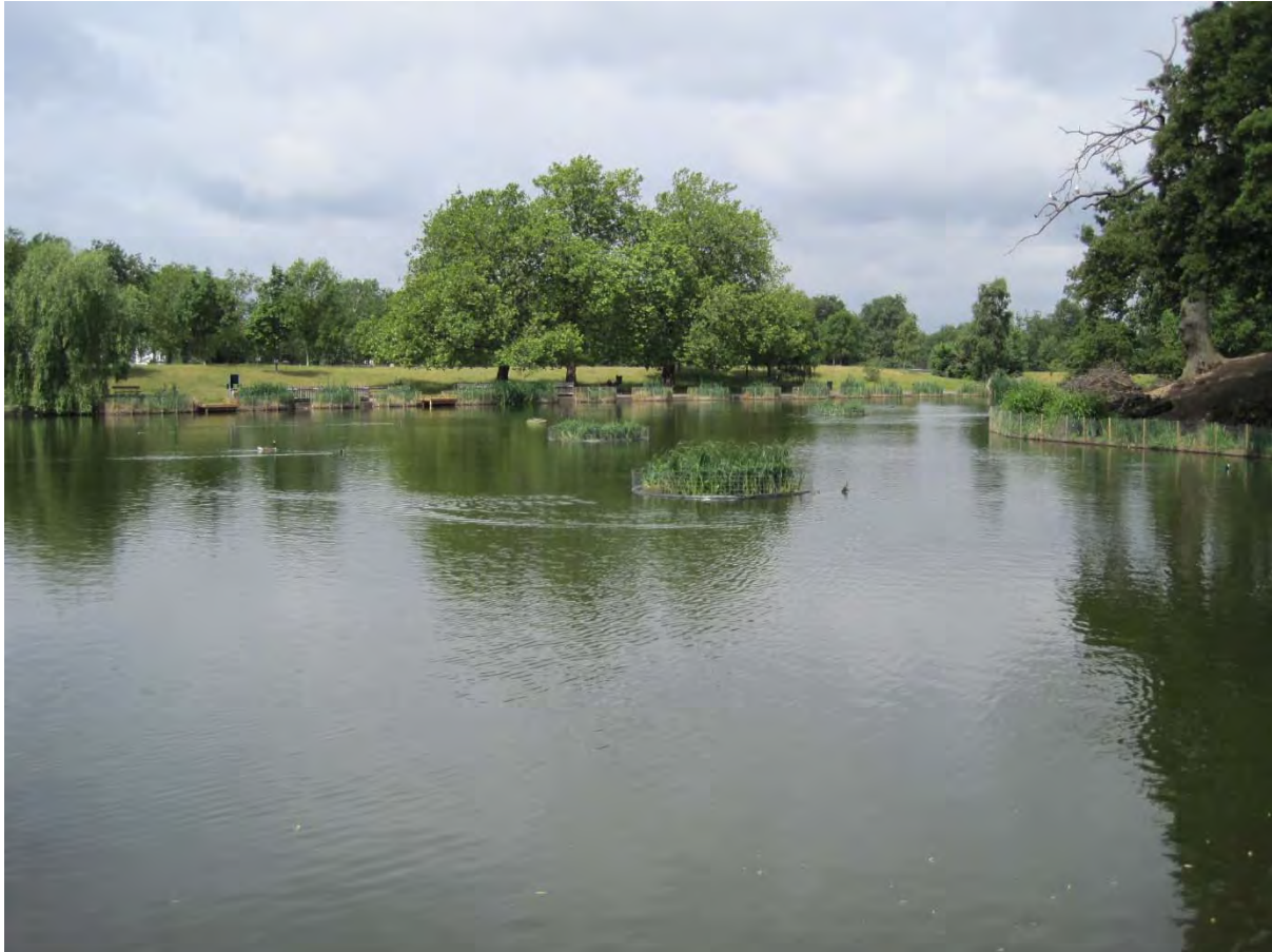
Plate 67. Mound Pond on Clapham Common, following a major restoration programme, with ecological enhancements including marginal reedbeds and floating islands

The three ponds on Clapham Common, being part of a registered Metropolitan Common, also have protection through commons legislation. In addition, all of the ponds on Clapham Common, in Brockwell Park and in Ruskin Park are 'registered fisheries', and as such are protected as such from loss or inappropriate use, and their management for biodiversity is encouraged as this improves their quality for management of existing fish stocks.