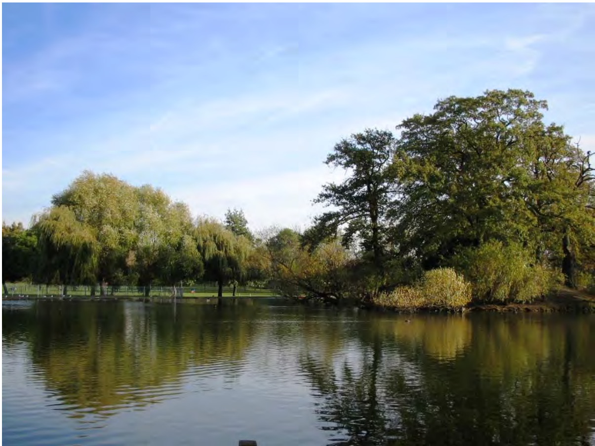
Plate 61. View of Mount Pond on Clapham Common

Lambeth's rivers and ponds are valued for their contribution to nature conservation. Many are rich in habitats, plants and animals which are increasingly restricted or uncommon in London, act as 'refuges' for wildlife as other important habitat is lost or declines in management and quality, or are used for environmental education purposes, whether formal and informal.