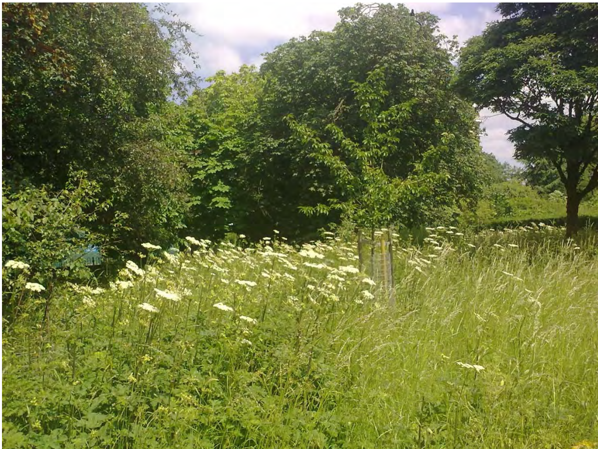
Plate 32. Species-rich meadow grassland in Ruskin Park, Herne Hill, which has become an important resource for numerous invertebrates, small birds and small mammals

Naturalised grasslands are normally best established on 'neutral' soils, which have a pH at or close to 7 (neutral). This then tends to favour numerous wild grasses and plants, including many that are important sources of nectar and pollen for pollinator species, or fruits and seeds for many wild birds and small mammals. They also form a 'tussocky' habitat that provides shelter and nesting habitat for many birds and small mammals, plus excellent conditions for ground hibernation by the larvae and pupae of many important invertebrates.